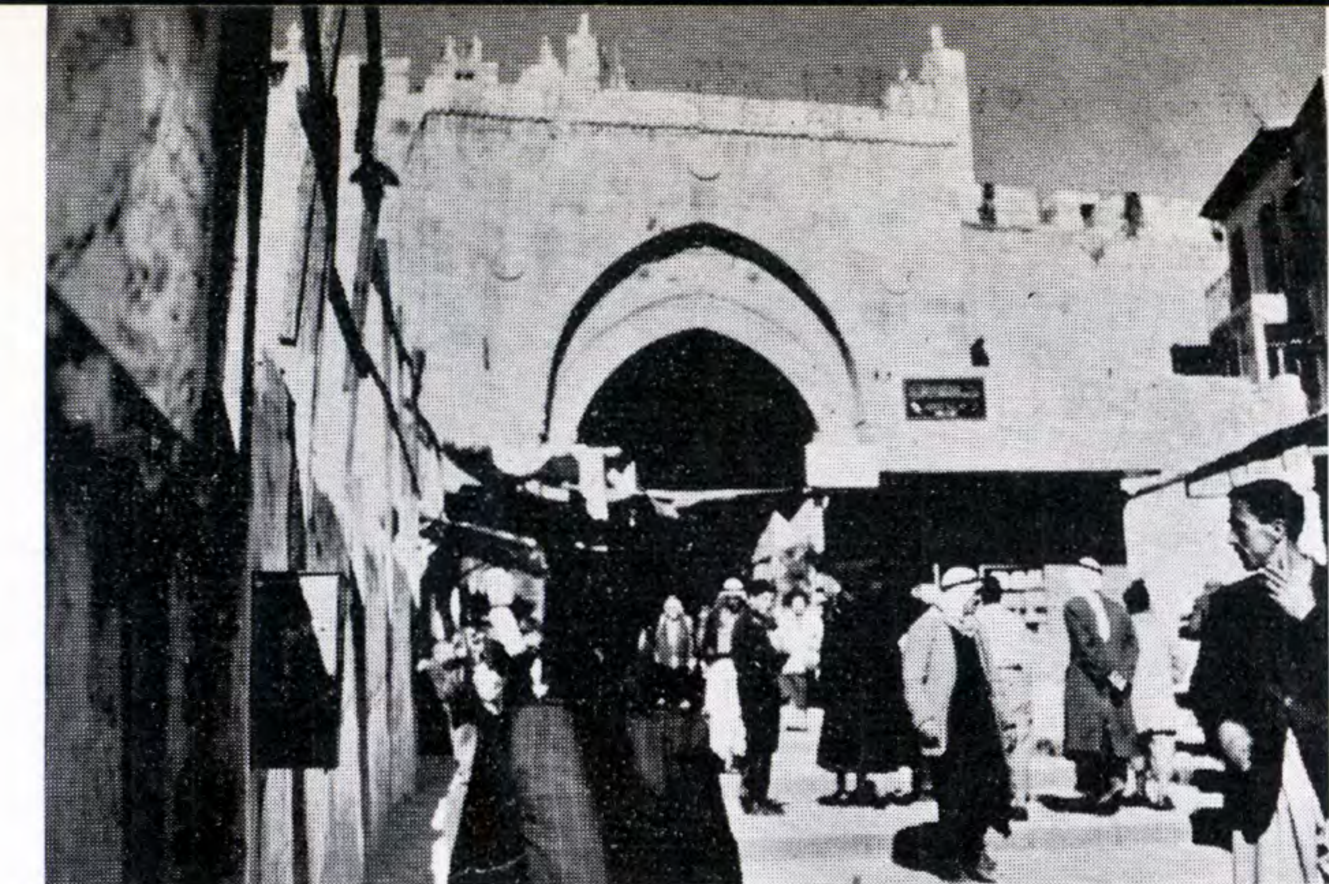
Damascus Gate - Old City, Jerusalem

within your view twists its tortuous way into the bitter waters of the Dead Sea. The hills of Trans-Jordan rise to the East, the Sea of Galilee glimmers to the west, and as you round majestic Mt. Hermon, the fabled oasis of Damascus comes into view. Damascus is the oldest continuously-inhabited city in the world, the site of St. Paul's conversion, and the legendary home of Abraham. The bare Anti-Lebanons (the ancient region of Abilene) are crossed, and give way to the greenness of the Biqaa Valley. Look directly below you for the ruined Graeco-Roman temple which was used by the Crusaders as a watch-tower. Baalbek is just barely visible to the north. Now you surmount Lebanon, and descend slowly over the peaceful red-roofed villages