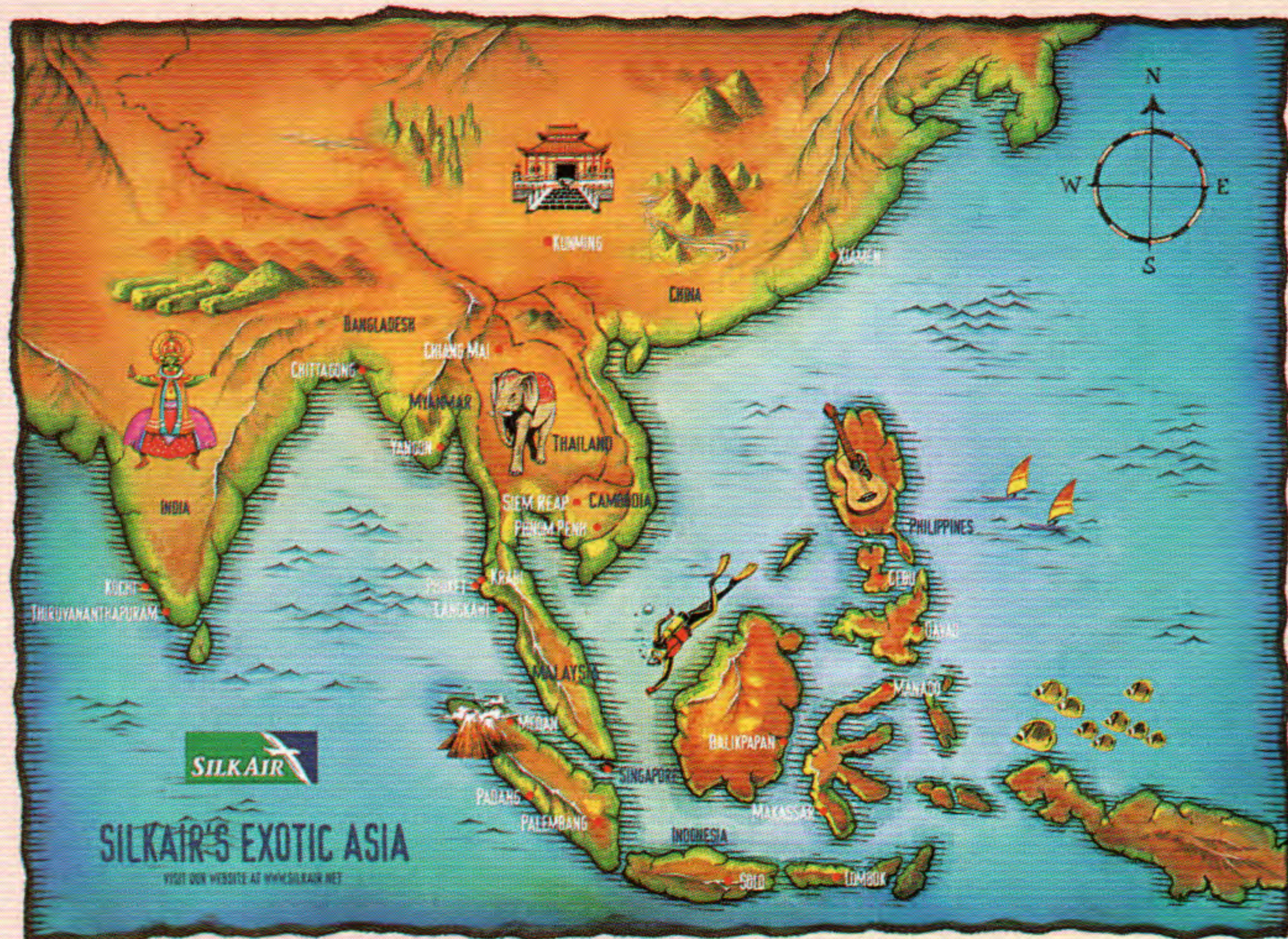
SILKAIR ROUTE MAP