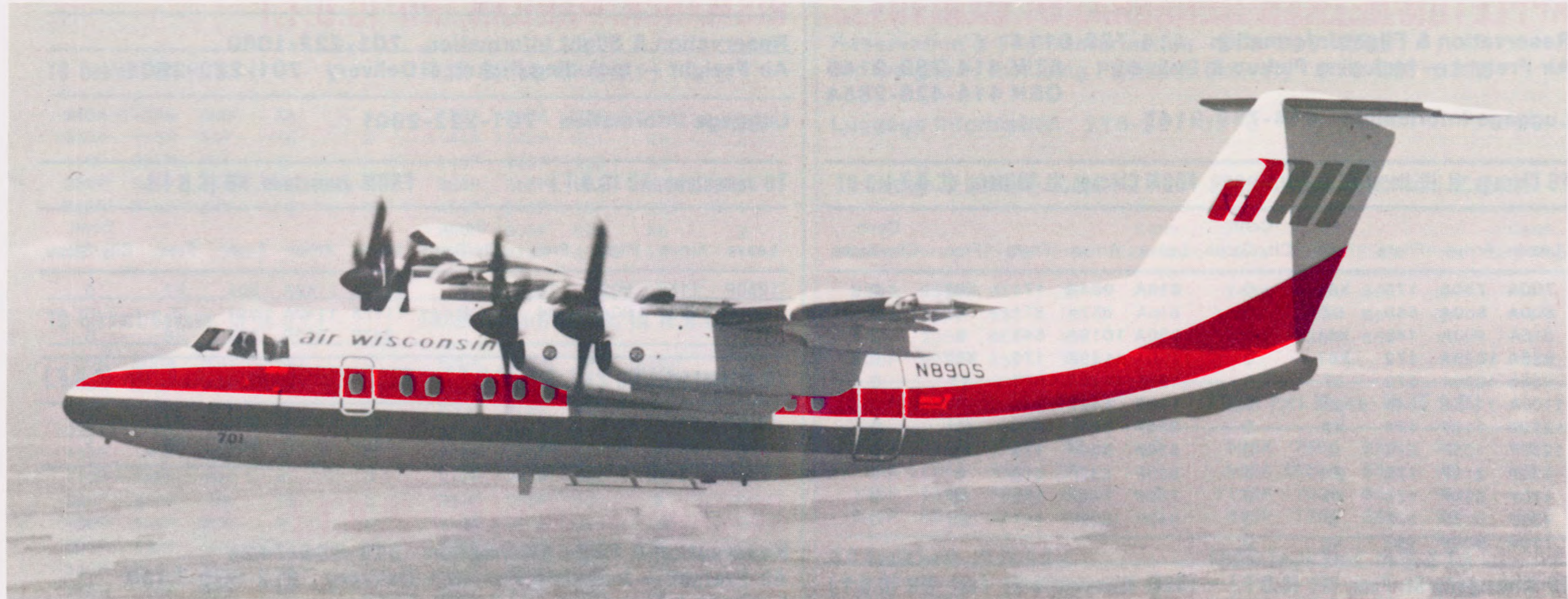
Air Wisconsin now offers service in several cities with our new 50 passenger de Havilland Dash 7. (Flights shown in bold type.)