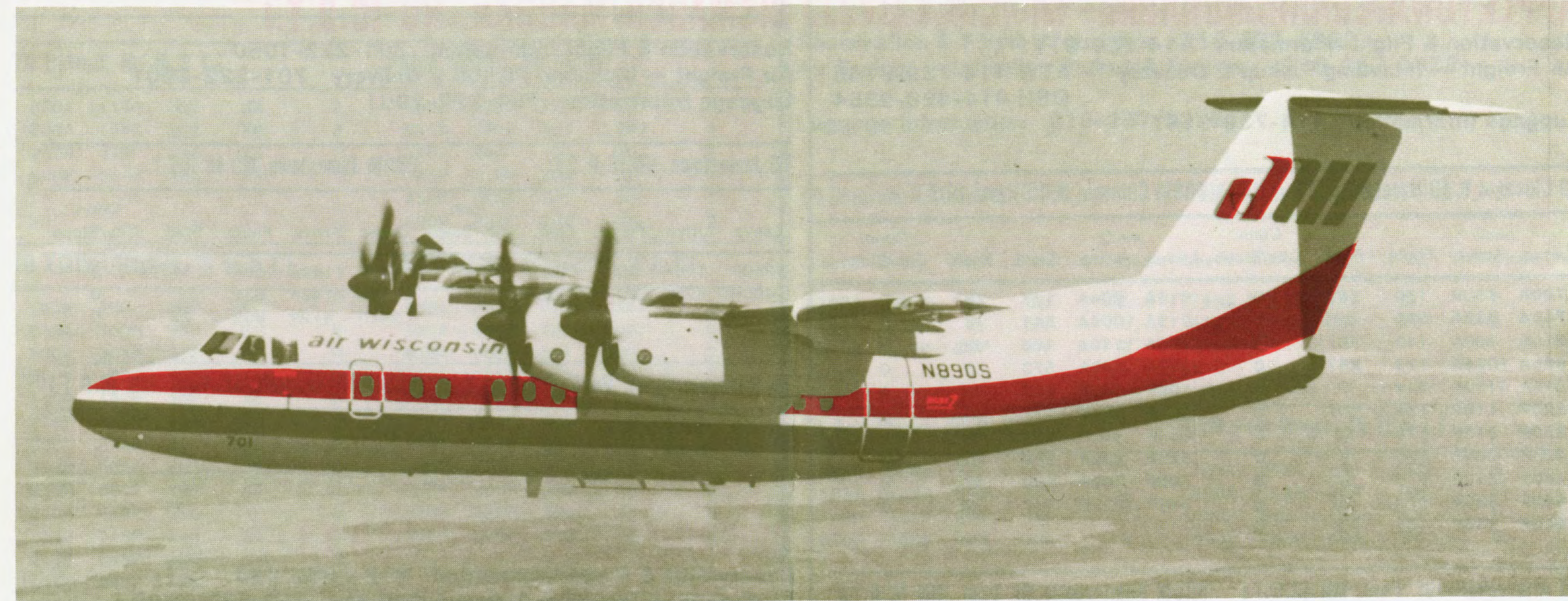
Air Wisconsin now offers service in several cities with our new 50 passenger de Havilland Dash 7. (Flights shown in bold type.)