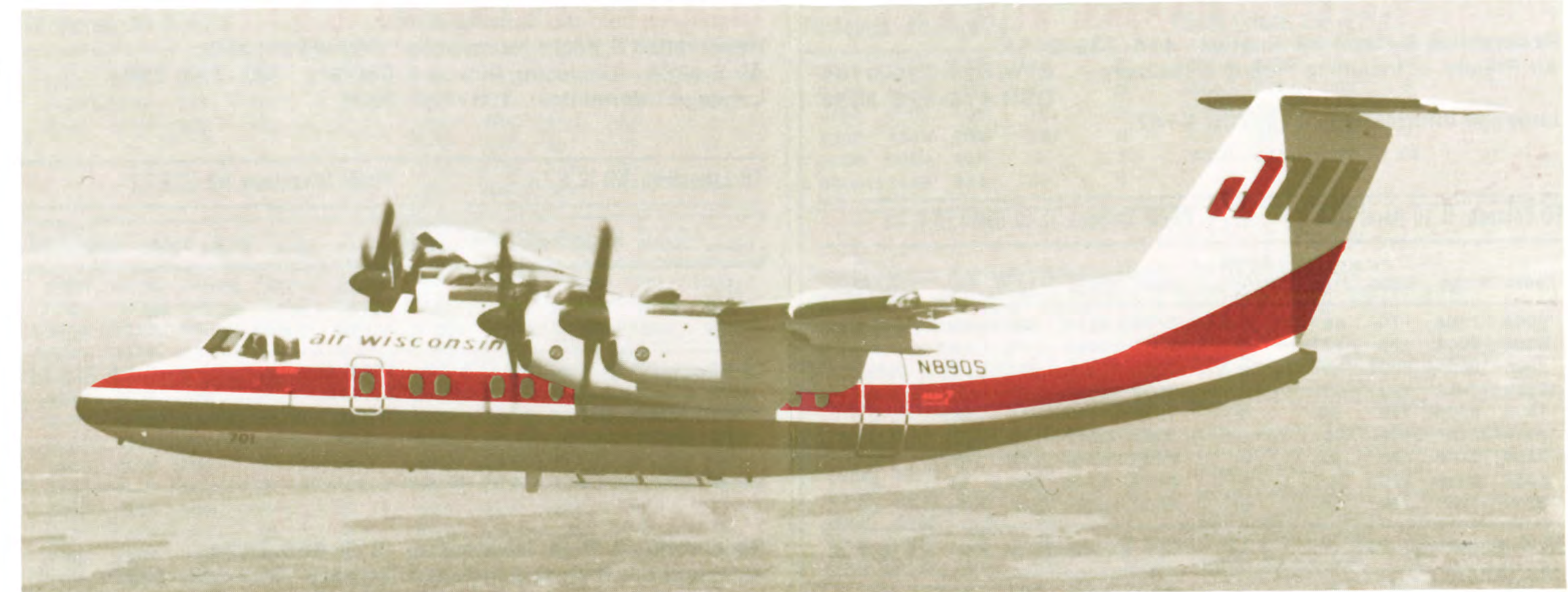
Air Wisconsin now offers service in several cities with our new 50 passenger de Havilland Dash 7. (Flights shown in bold type.)