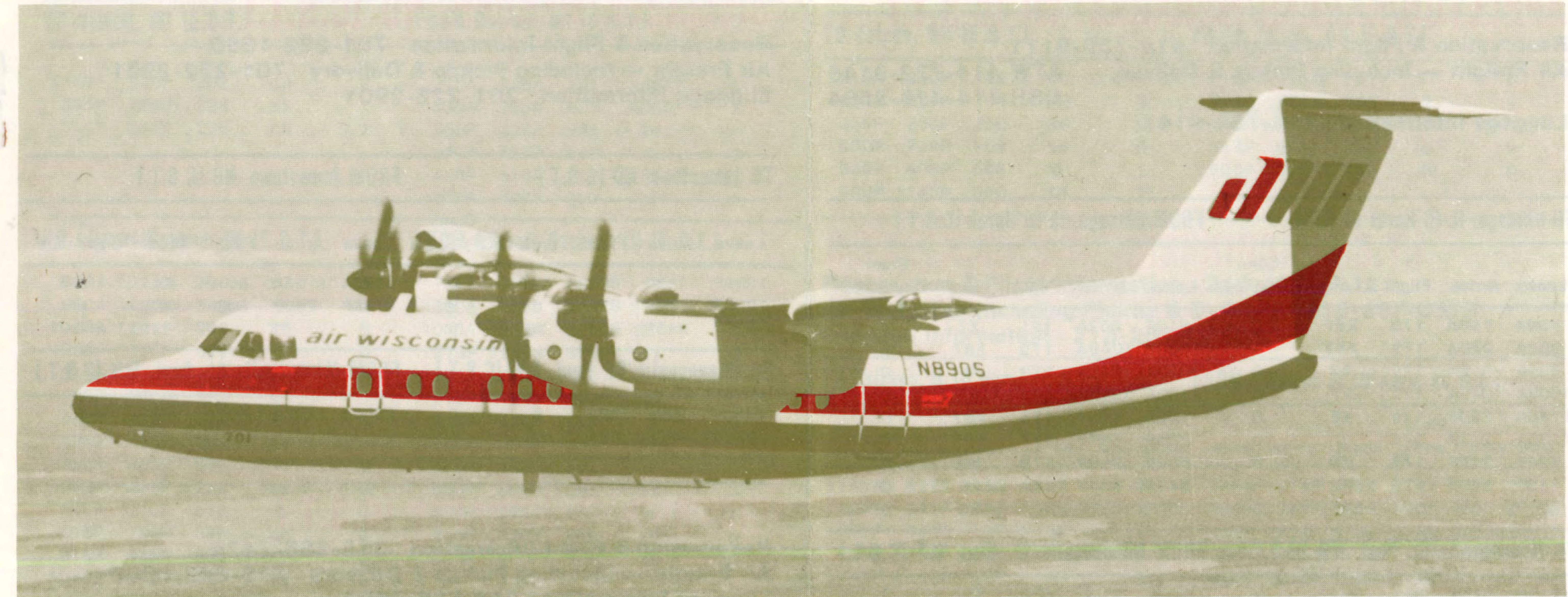
Air Wisconsin now offers service in several cities with our new 50 passenger de Havilland Dash 7. (Flights shown in bold type.)