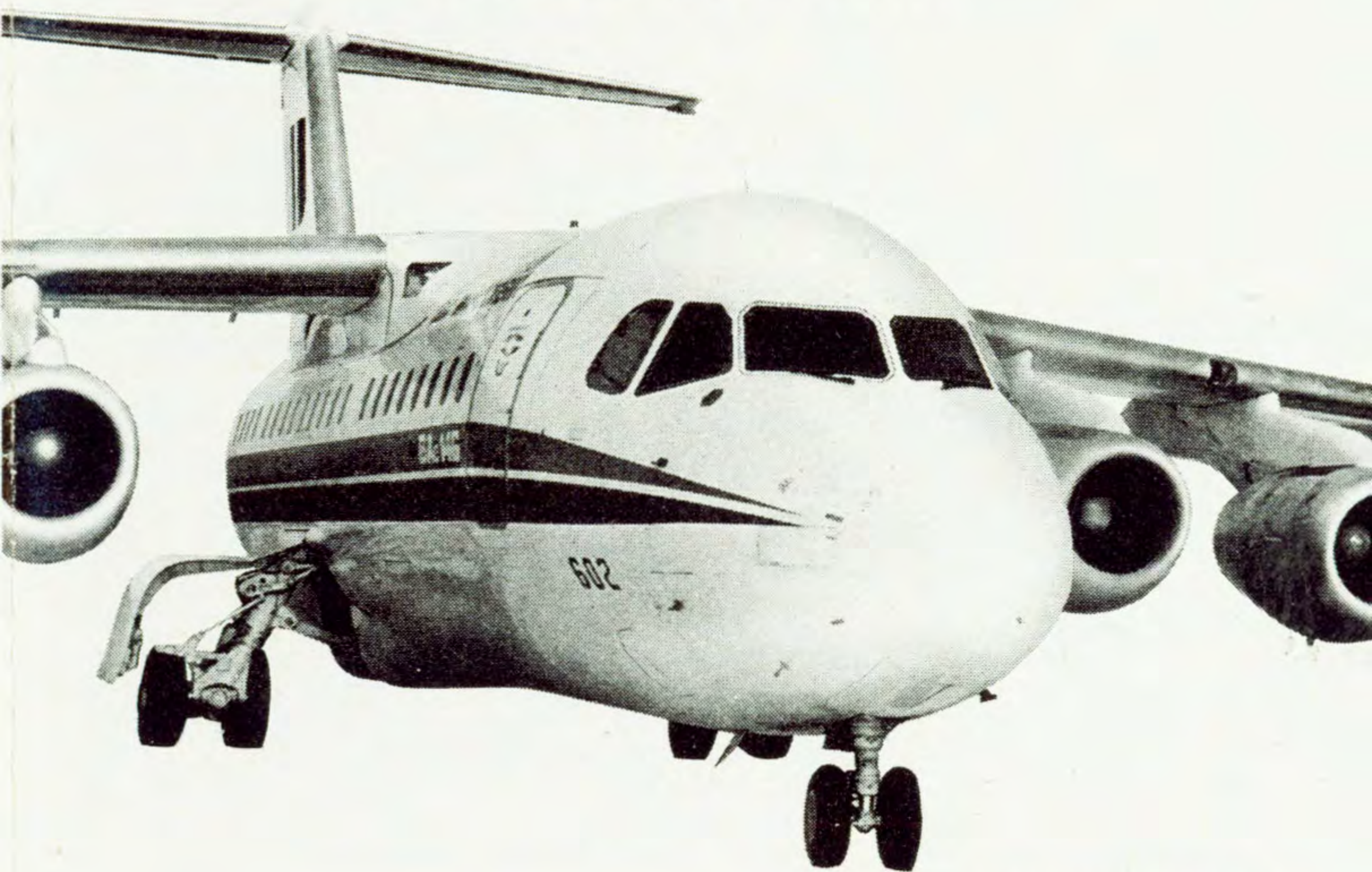
British Aerospace 146 Jet