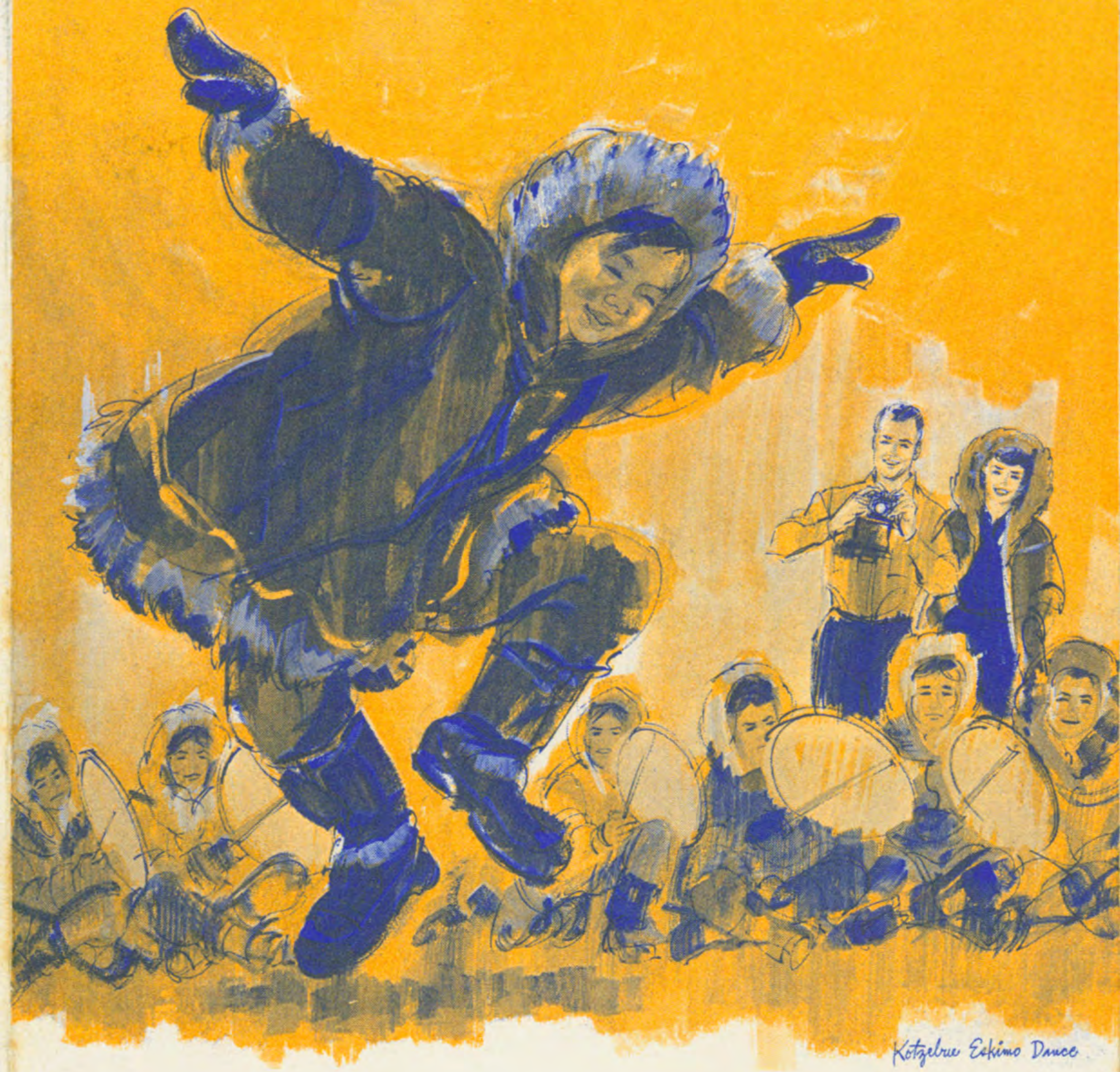
Kotzebue Eskimo Dance