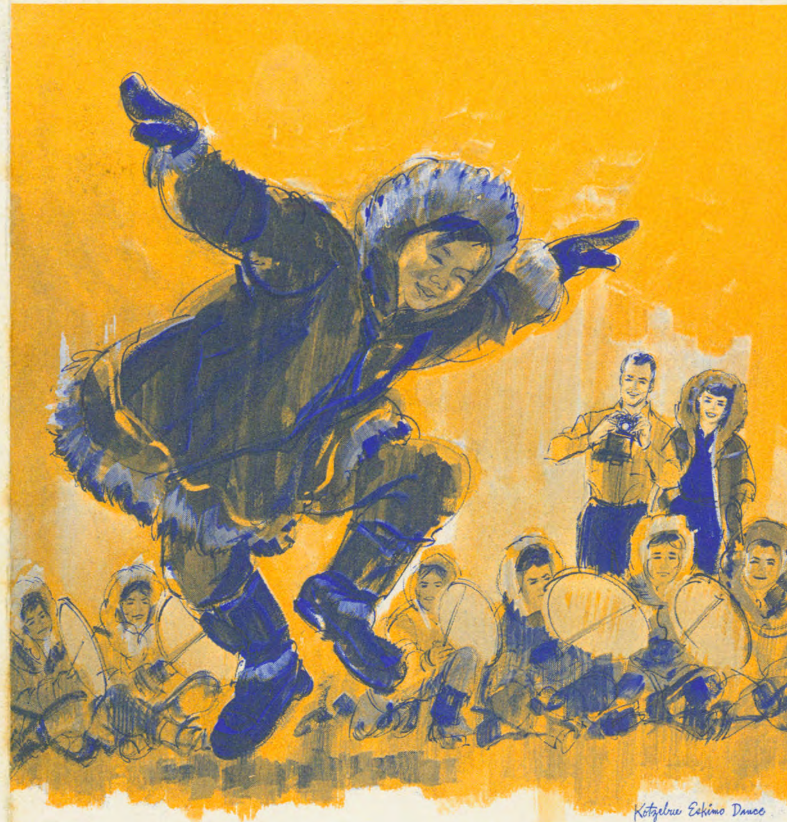
Kotzebue Eskimo Dance

HAYNES TRAVEL BUREAU, INC. 1503 MAIN ST. P. O. BOX 1 SEATTLE 1, WASHINGTON, FLORIDA