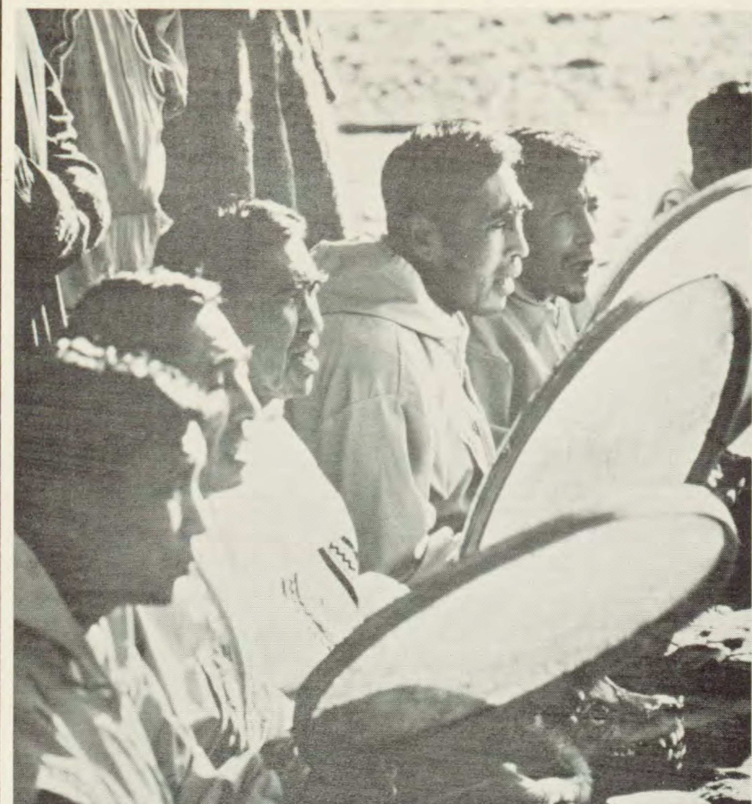
The skin drum, made of walrus stomach, is the only musical instrument the Eskimo uses. The beat of this drum and the rhythmic chant of the musicians provide background for centuries old stories told in colorful Eskimo native dances you'll witness at Nome and Kotzebue.

Alaska Airlines offers an outstanding variety of escorted and independent tour itineraries utilizing all modes of transportation, visiting all areas of Alaska. To secure copies of these brochures, contact your travel agent, any Alaska Airlines office or Alaska Airlines Tour Department, Seattle-Tacoma International Airport, Seattle, Washington 98158.