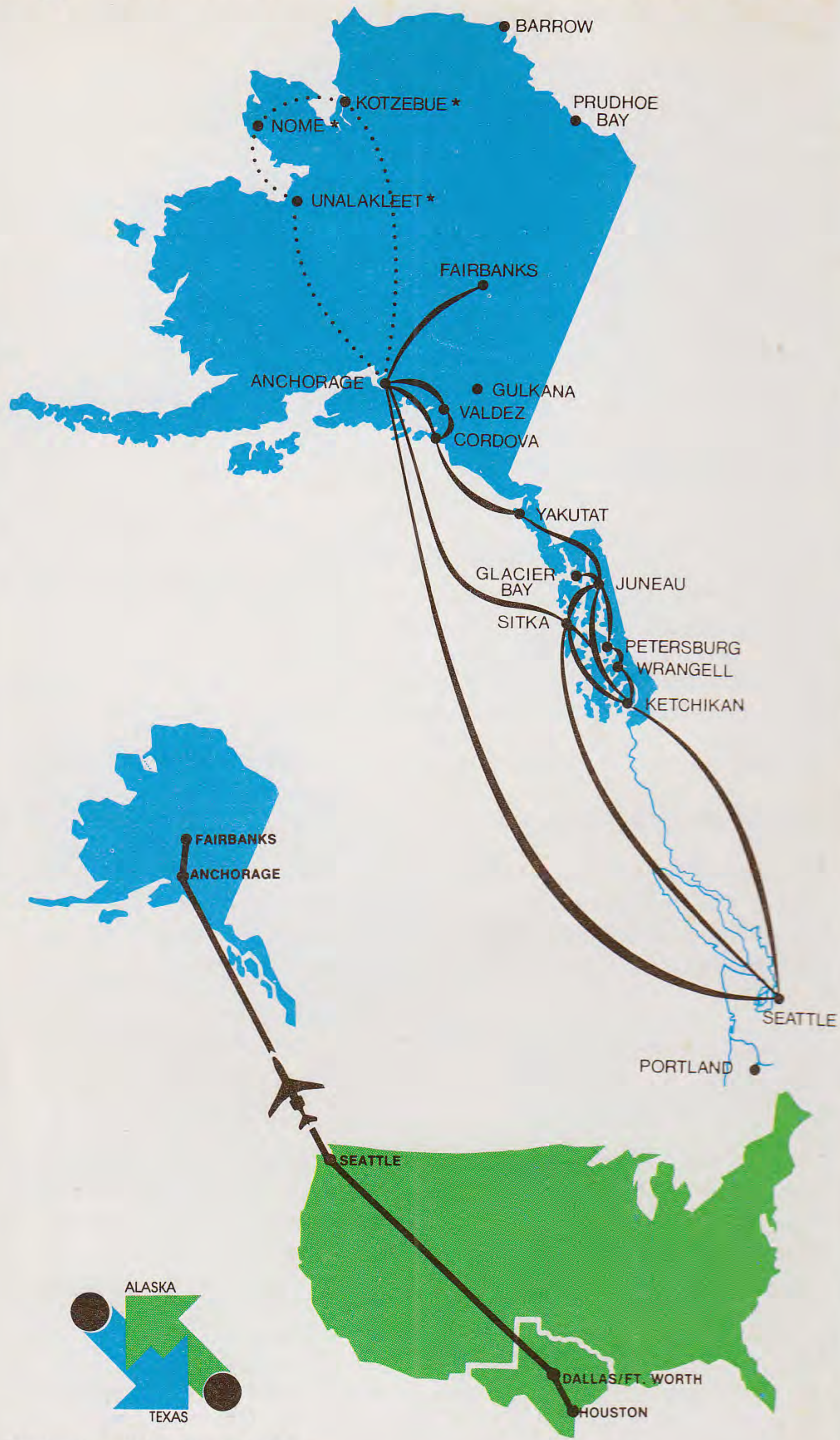
Alaska-Braniff Pipeline Express