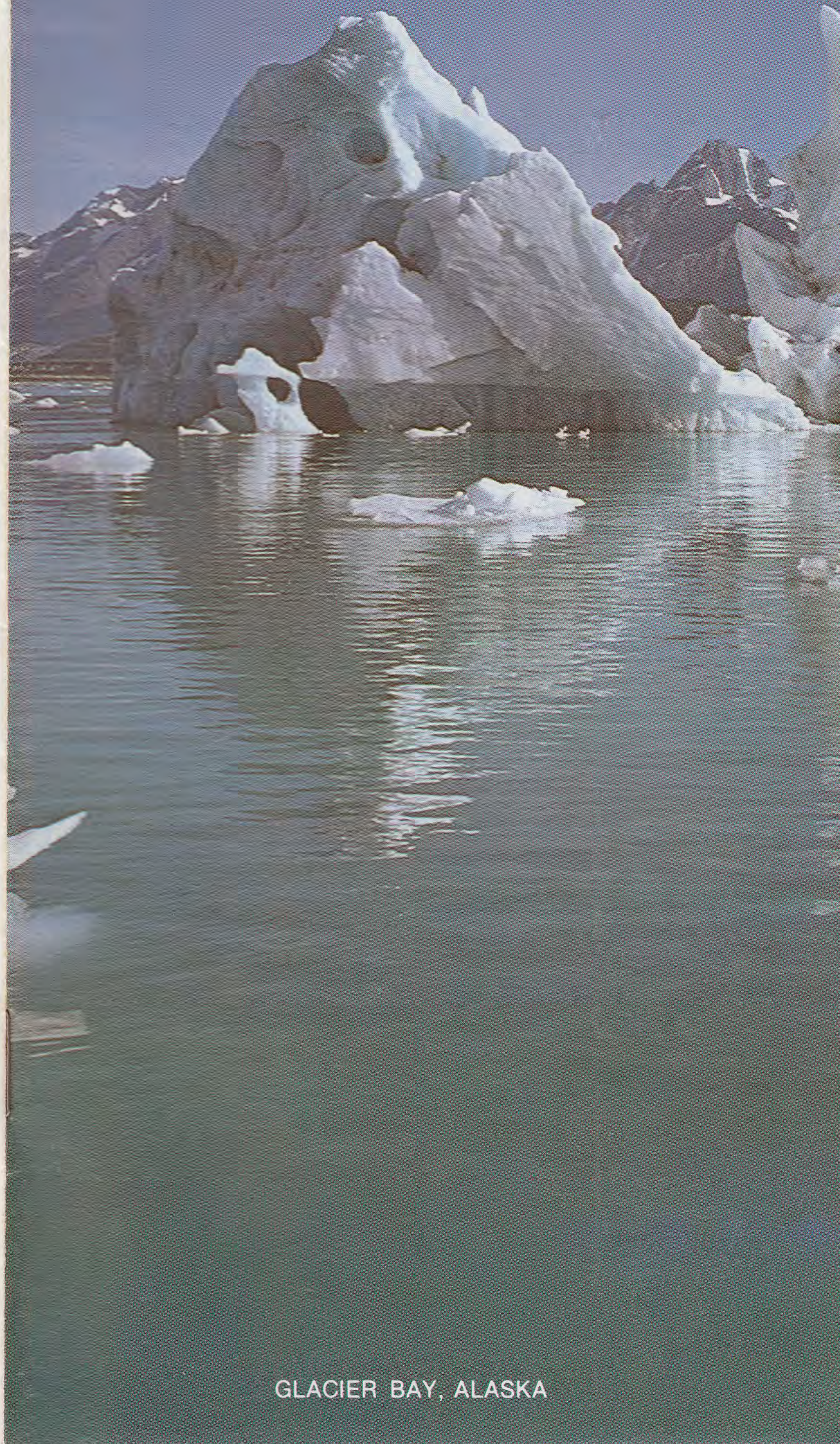
GLACIER BAY, ALASKA