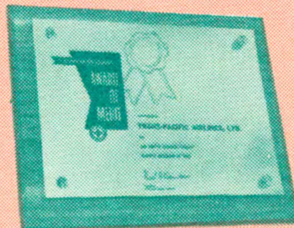
Perfect safety record