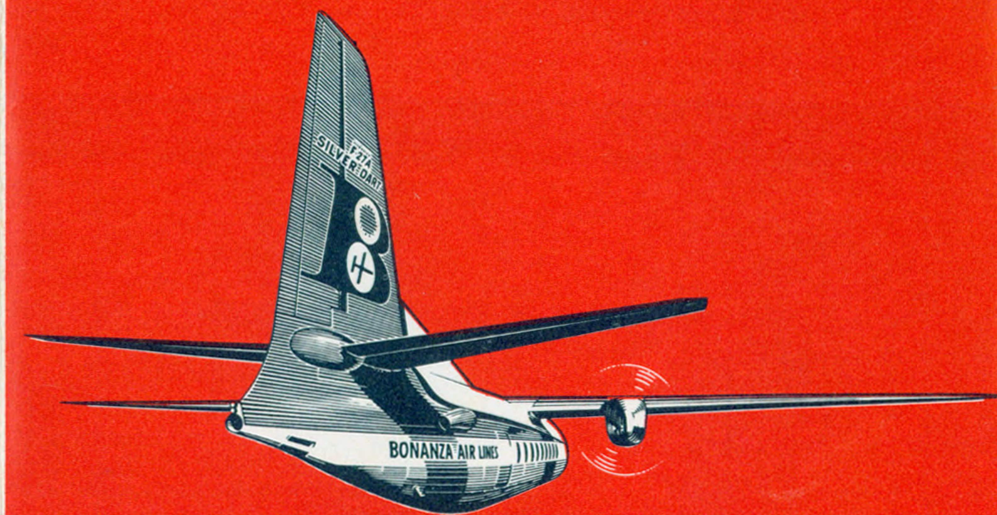
FIRST ALL JET-POWERED AIRLINE IN AMERICA