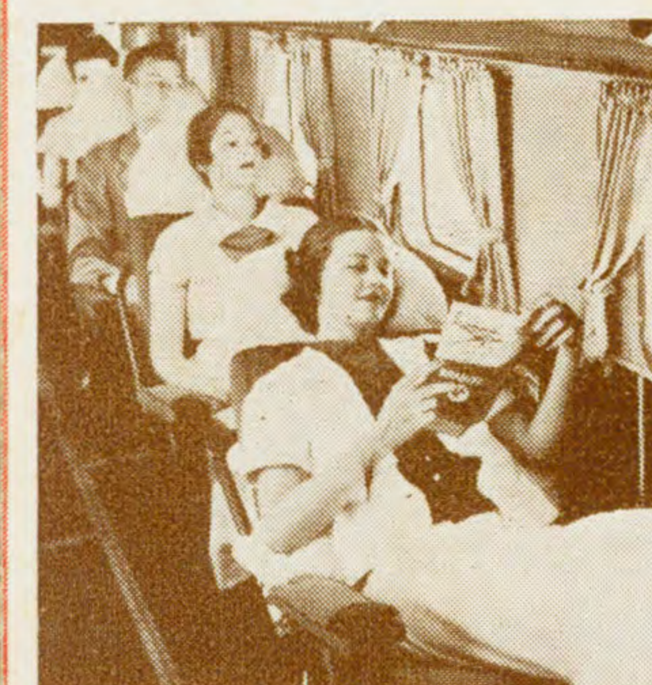
Women find individual windows and lights, luxurious reclining arm chairs and ample leg room for complete relaxation.