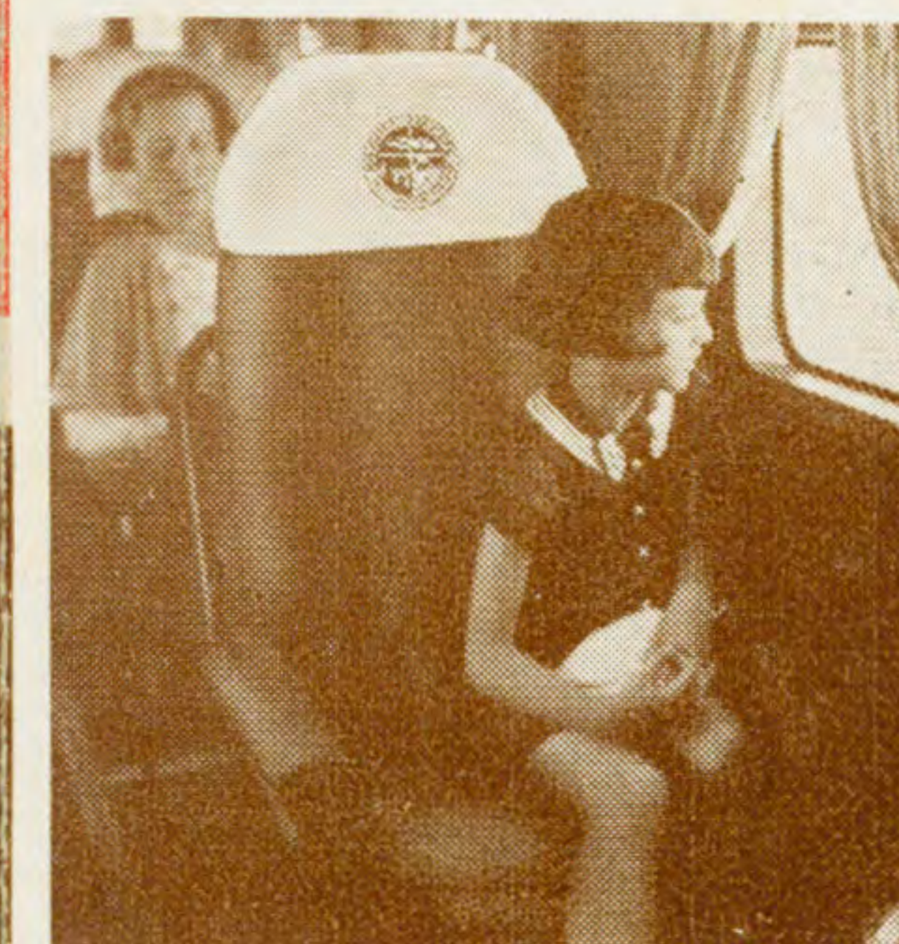
Even children prefer Braniff! Reclining, upholstered chairs and all comfort facilities provide complete enjoyment.

...BRANIFF SPREADS NEW Douglas Wings OVER THE SOUTHWEST