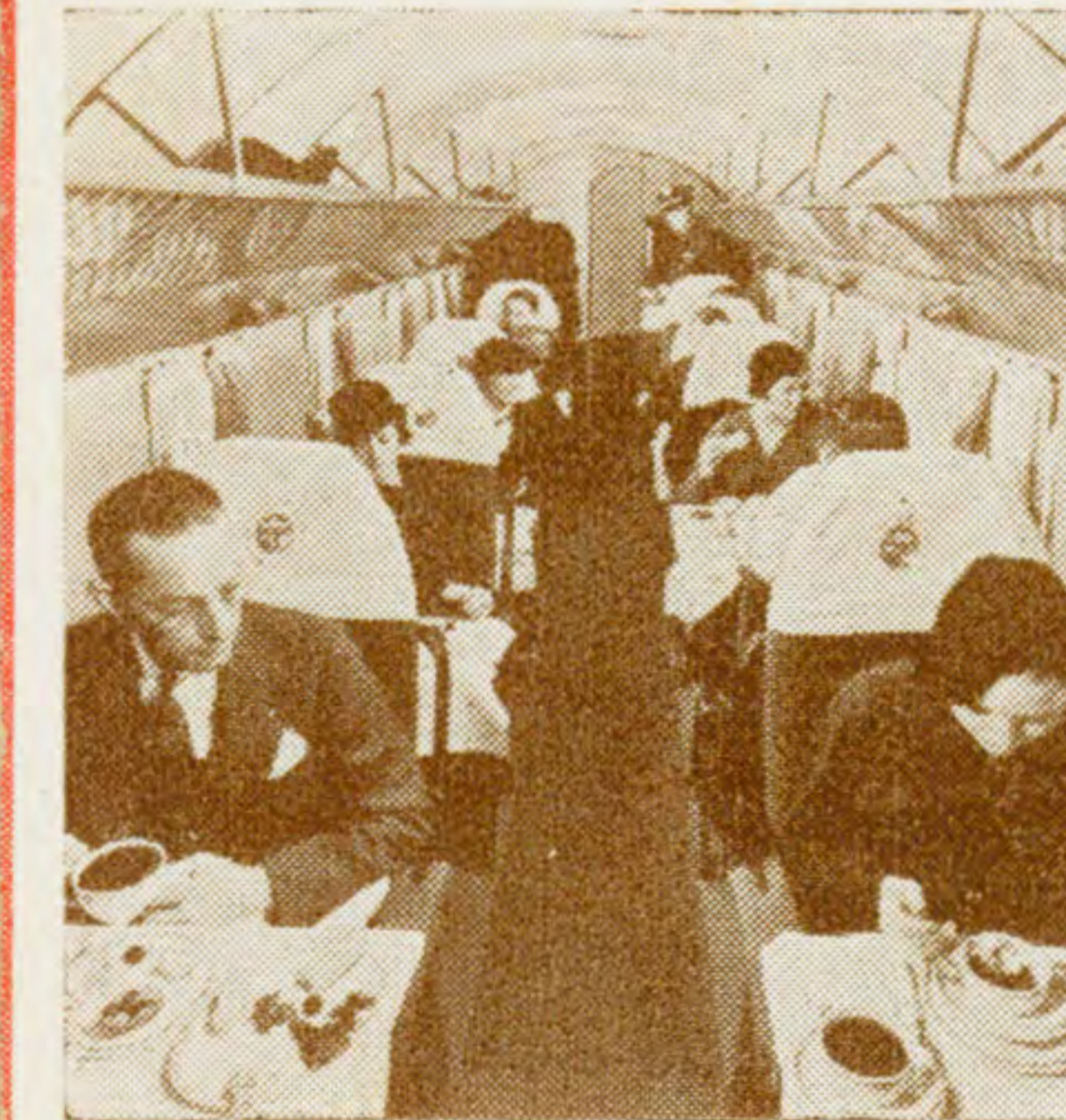
Delightful meals aloft! Individual serving! Another feature of Braniff's thoughtful service aground and aloft.