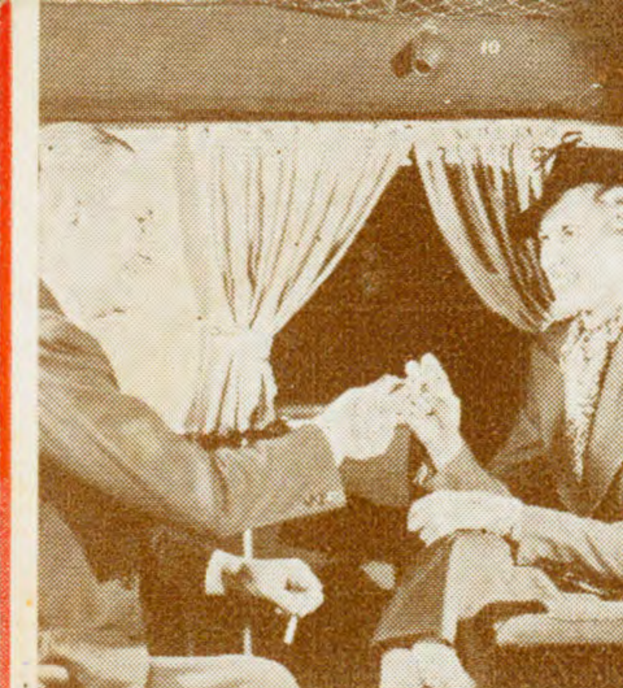
Smoke, if you like! Individual ventilators and ash trays. Reversible, upholstered chairs make tete-a-tetes easy and comfortable.

TWO MOTORS TWO WAY RADIO TWO PILOTS TWO RUDDERS for Smoother Flying