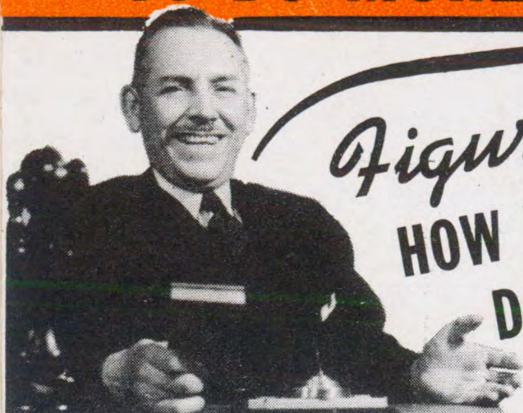
Figure It Up.. HOW MUCH IS A DAY OF YOUR TIME WORTH?