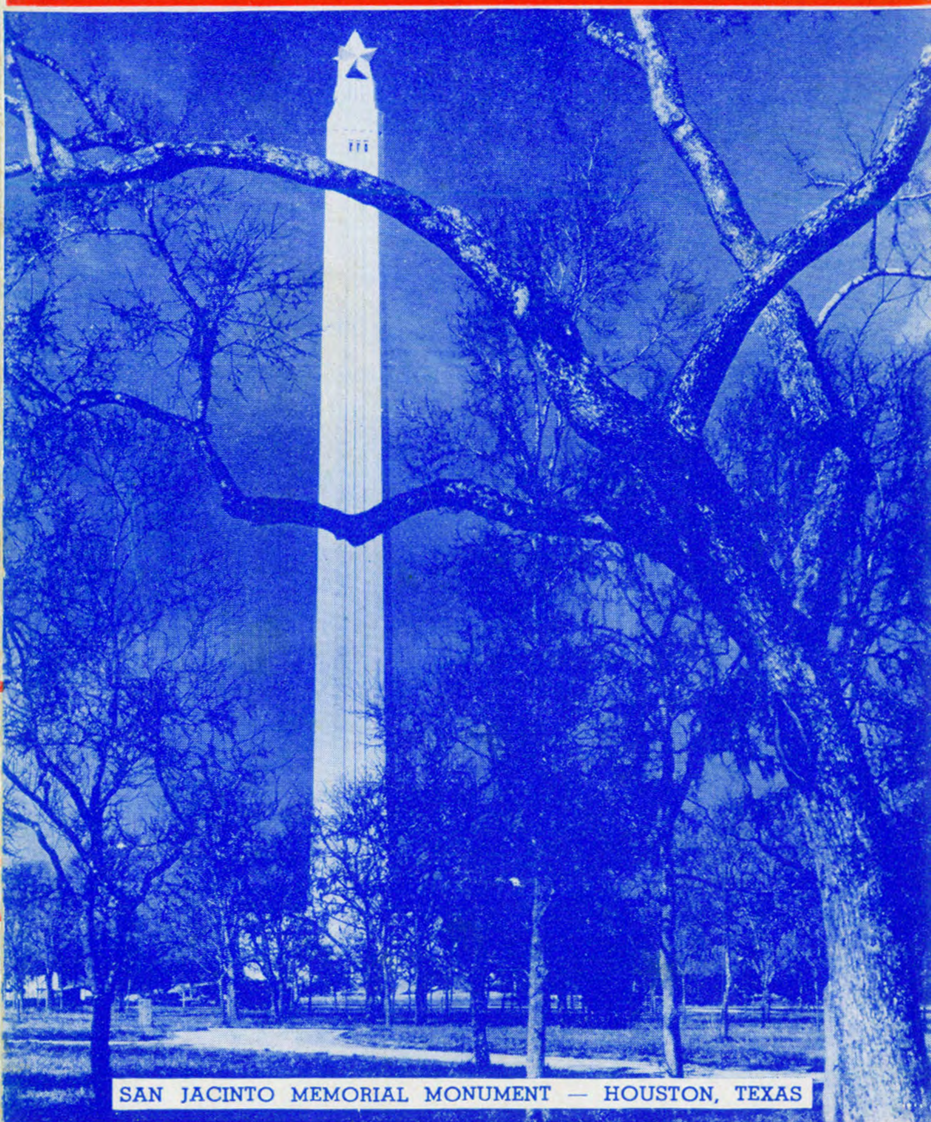
SAN JACINTO MEMORIAL MONUMENT — HOUSTON, TEXAS