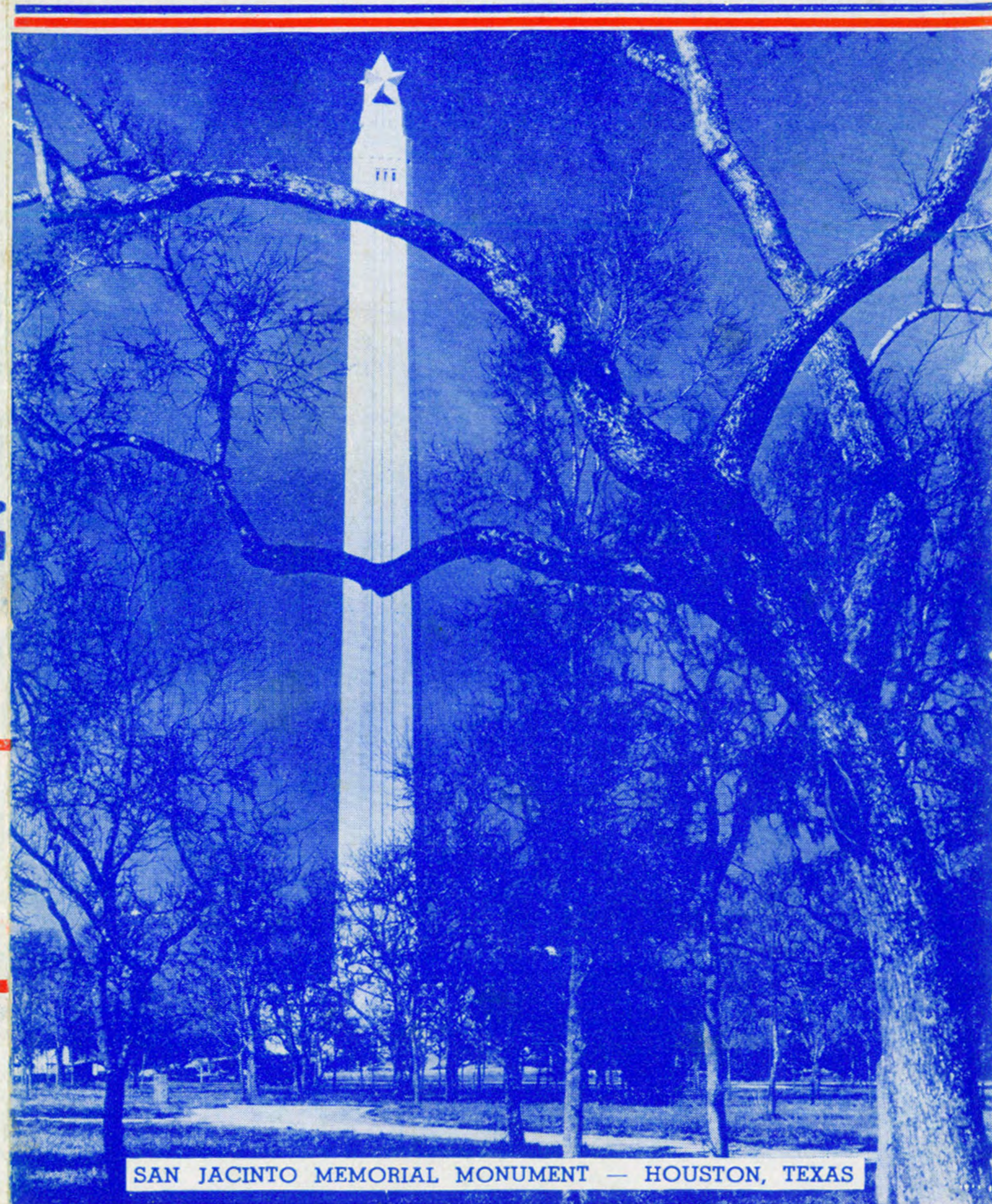
SAN JACINTO MEMORIAL MONUMENT — HOUSTON, TEXAS