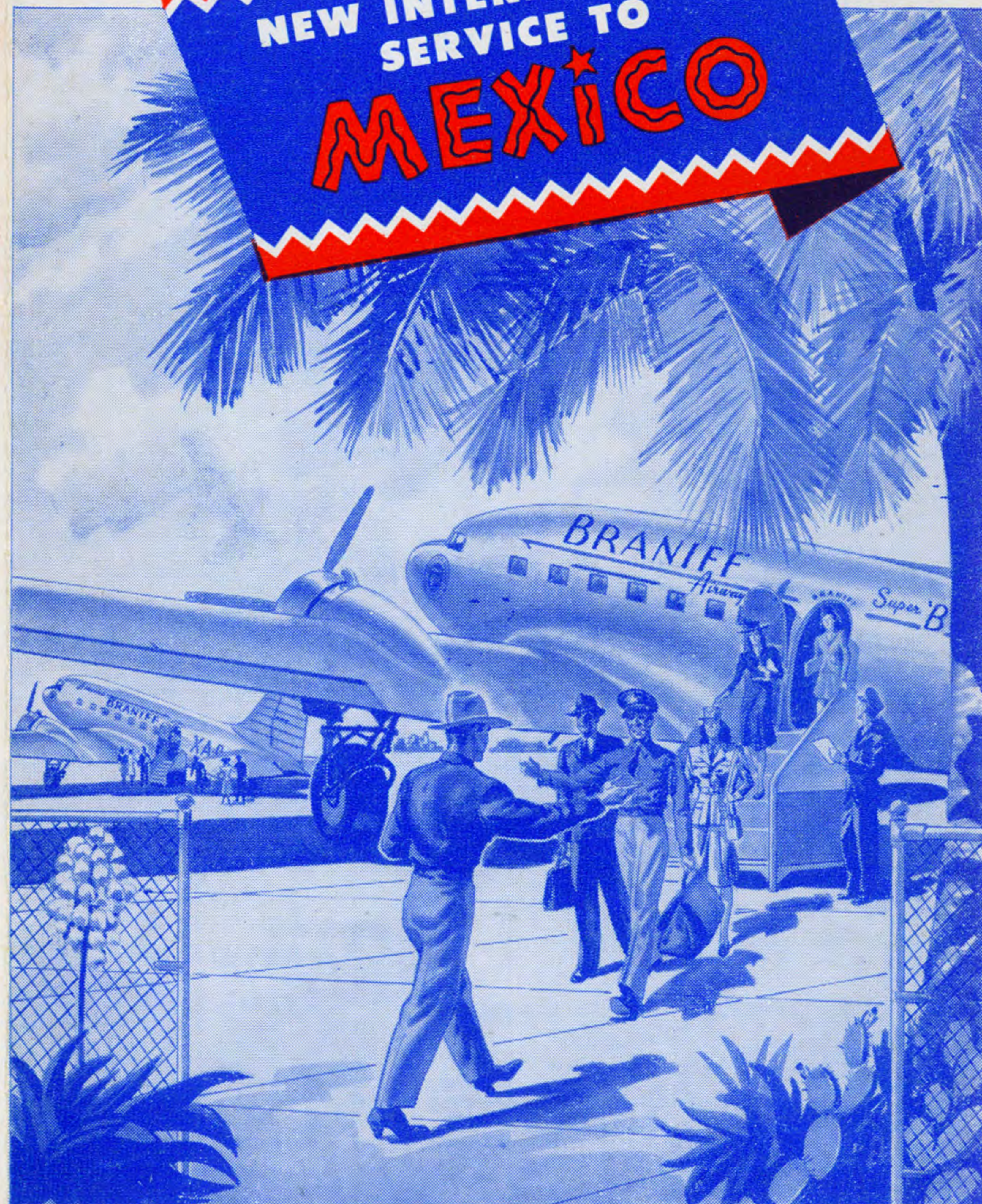
(See Back Cover)

FROM THE GREAT LAKES... and the Rockies ...TO THE GULF