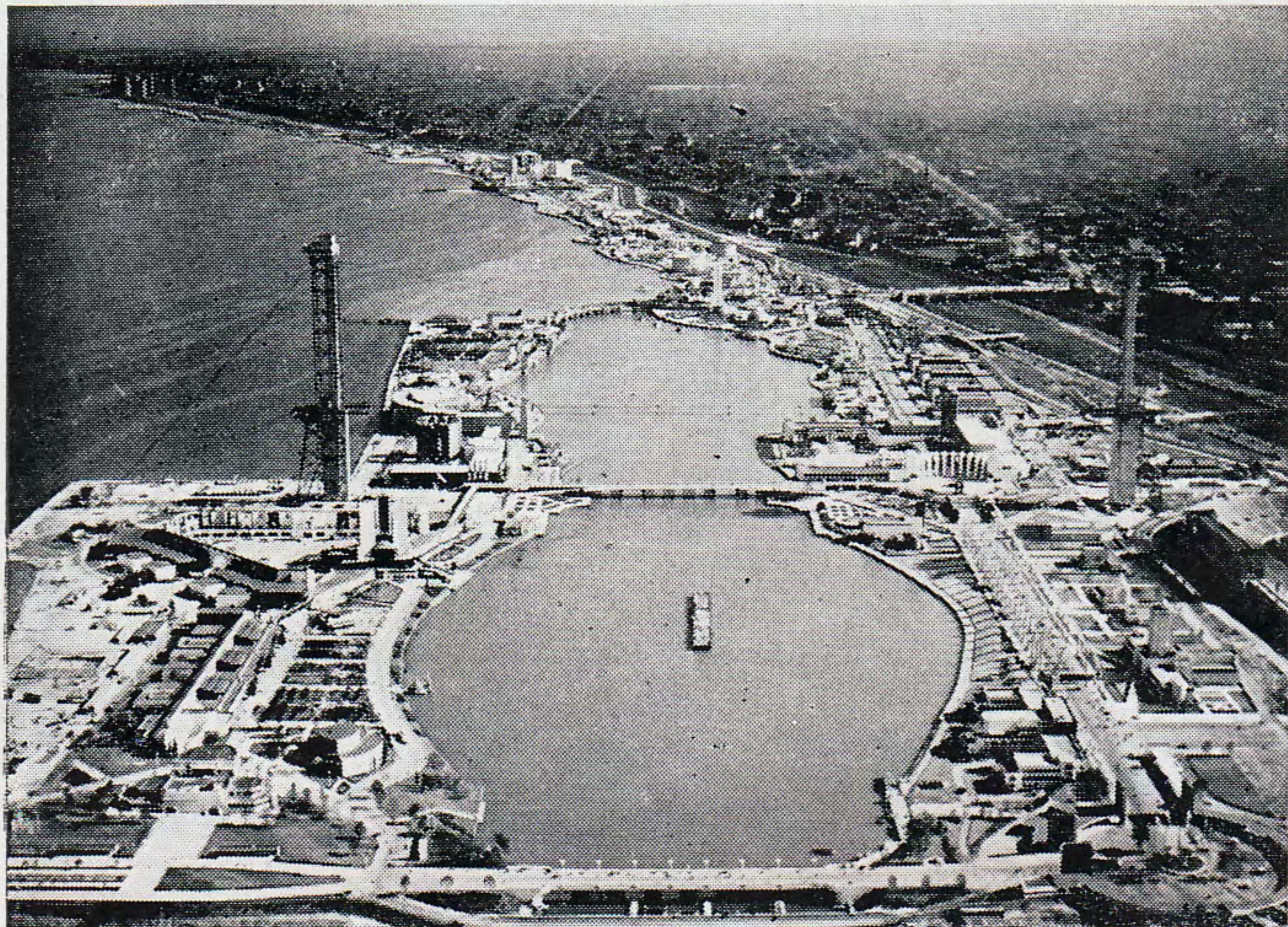
A birds-eye view of the Century of Progress Exposition in Chicago. Hundreds are visiting it this summer via Pacific Seaboard Air Lines, the Cool Route to the World's Fair.