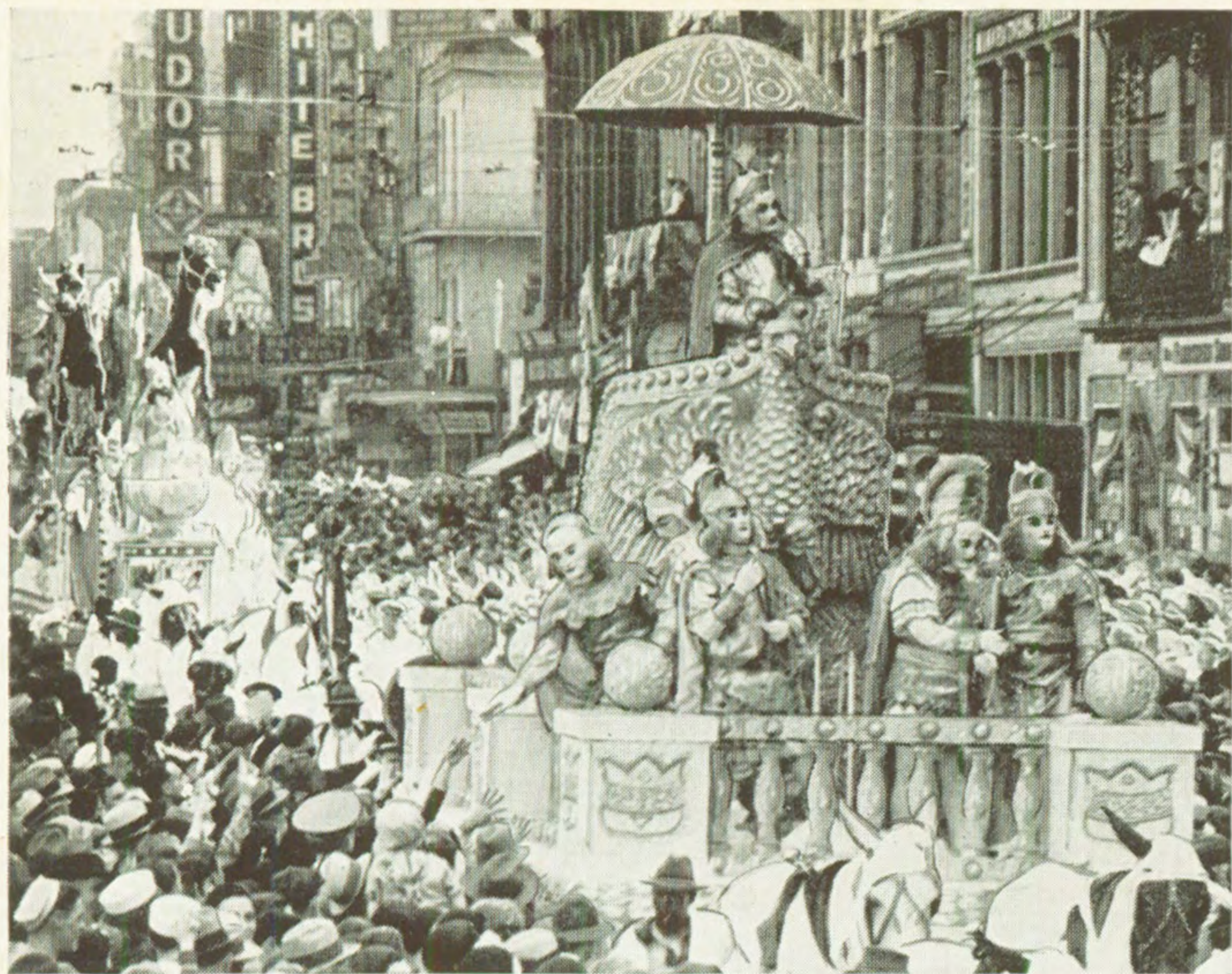
Alive with the romance and color of old French Louisiana, is the Mardi Gras festival in New Orleans—one of the many attractions that draw the World of Sport and Fashion to this city throughout the year.