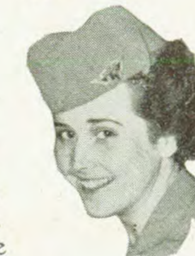
Miss American Aviation