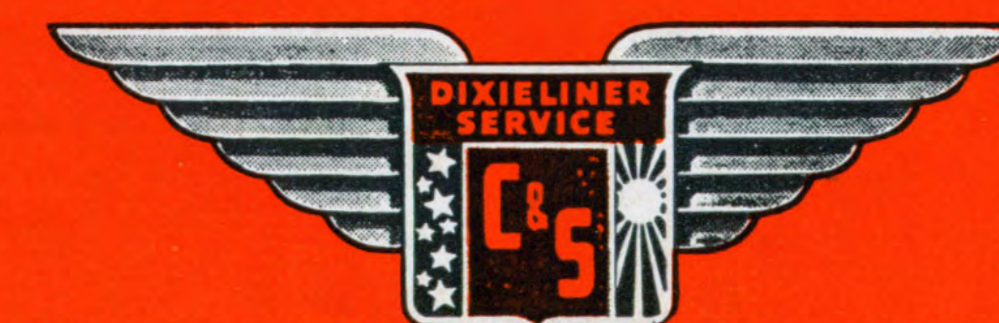
"The Valley Level Route"