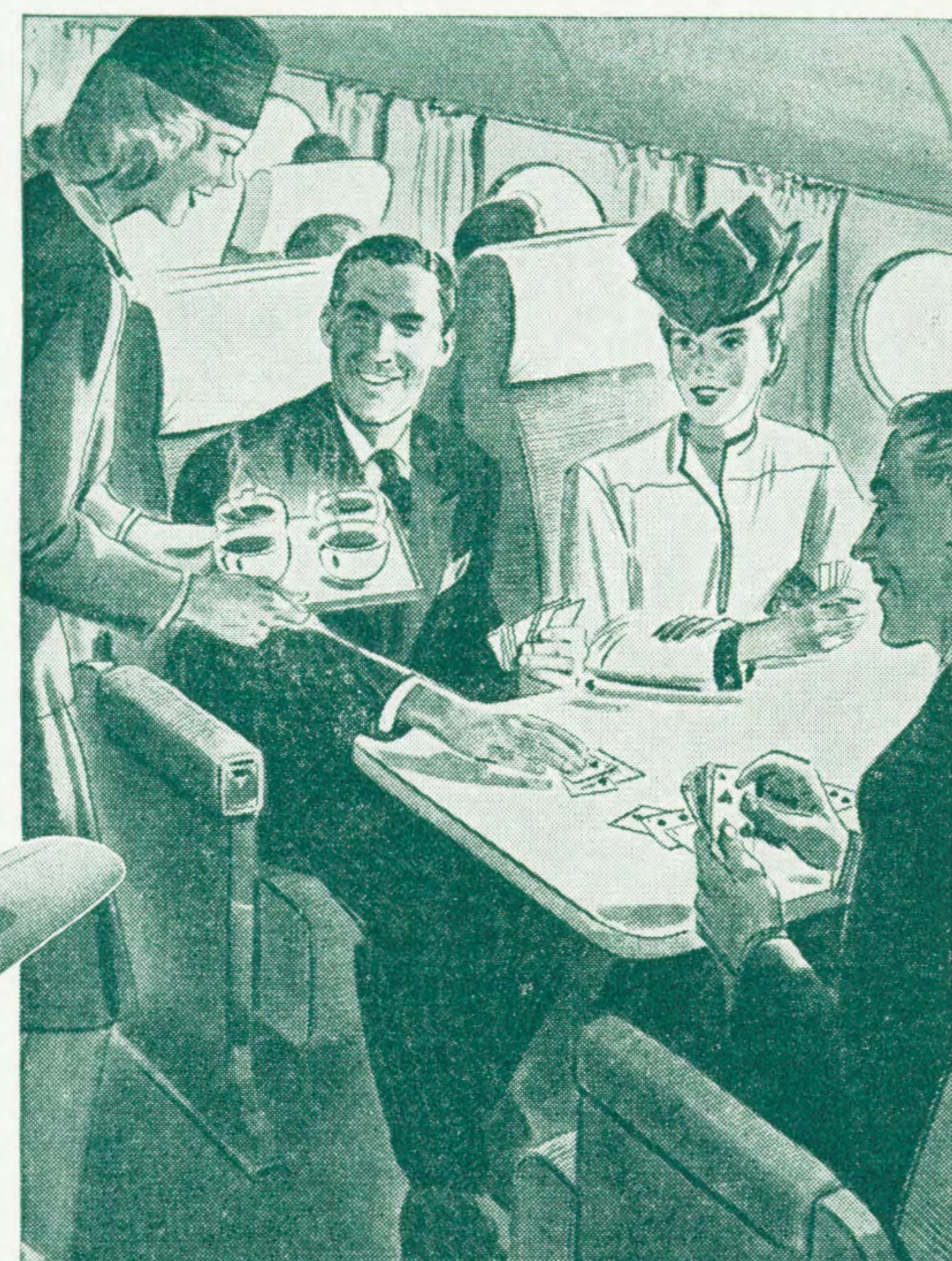
Handsome lounge grouping seats four in full comfort.

Enjoy their many extra advantages (at no extra cost) on your next trip between the Great Lakes and the Gulf.