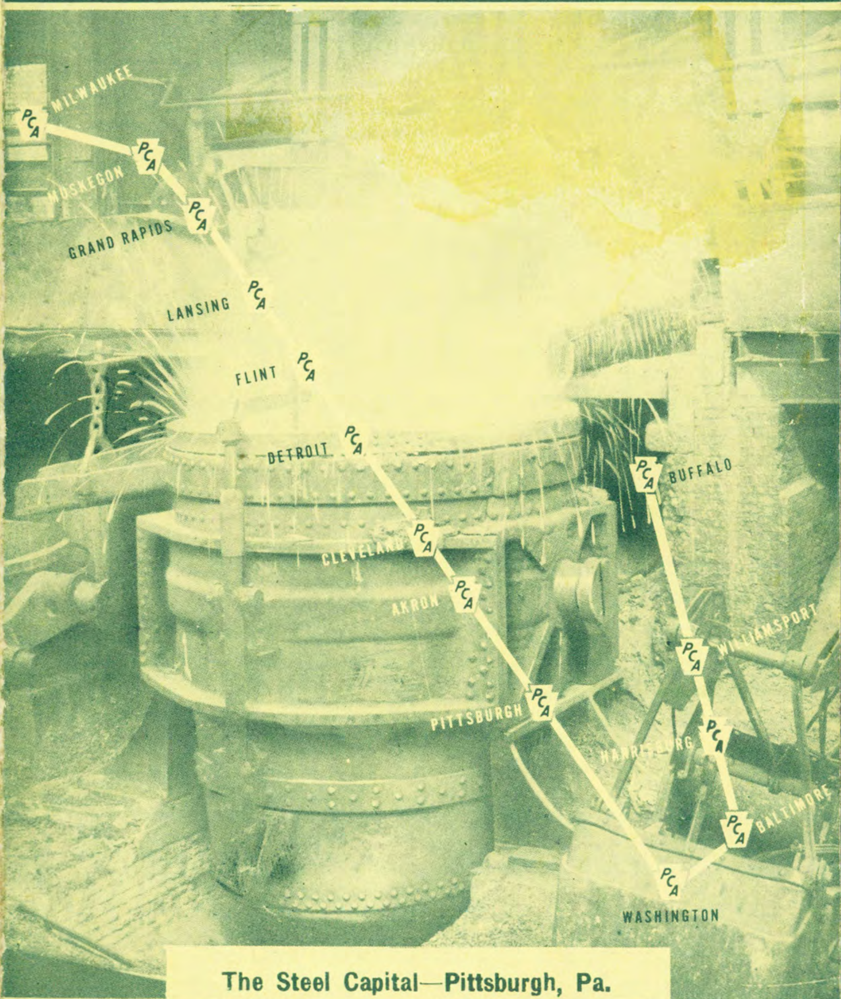
The Steel Capital—Pittsburgh, Pa.

WASHINGTON PITTSBURGH AKRON CLEVELAND DETROIT LANSING FLINT