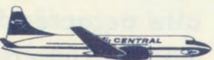
September 1962 Fleet of 24 DC3s and Radar Convairs

One of America's Scheduled Public Service Airlines Serving