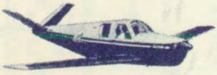
September 1949 2 Beechcraft Bonanzas