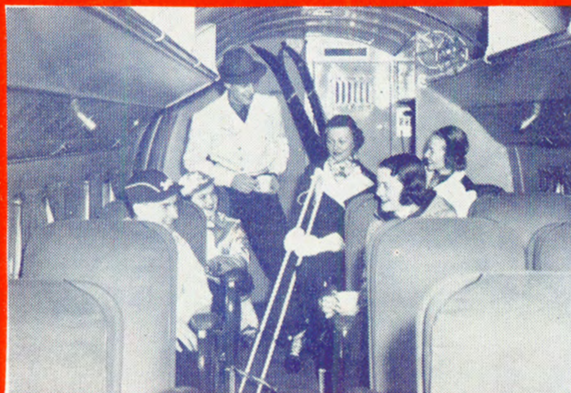
In New York this morning this skiing party donned warm clothes, ate a hearty breakfast.

Here's to comfort—CANADIAN COLONIAL AIRWAYS at your service!