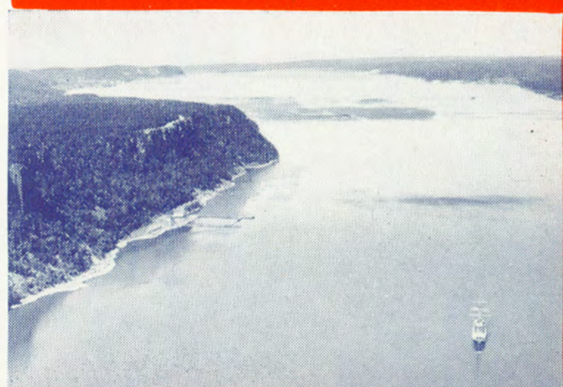
Above: En route, majestic Palisades of the Hudson.