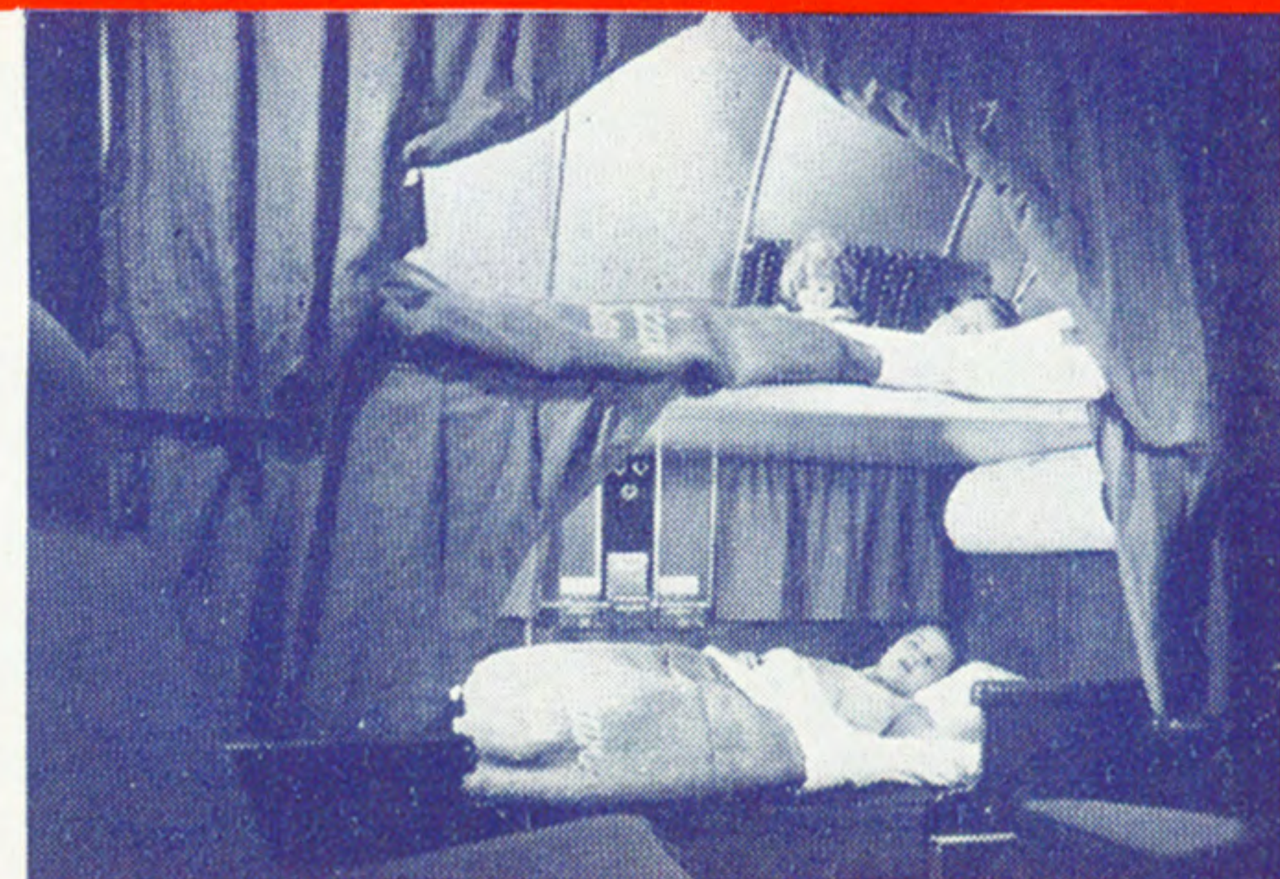
American Airlines Flagship Skysleepers from New York to California overnight offer downy berths, large as twin beds.

EQUIPMENT: Douglas DC-2 New York-Montreal; Stinson Reliant Montreal-Ottawa.