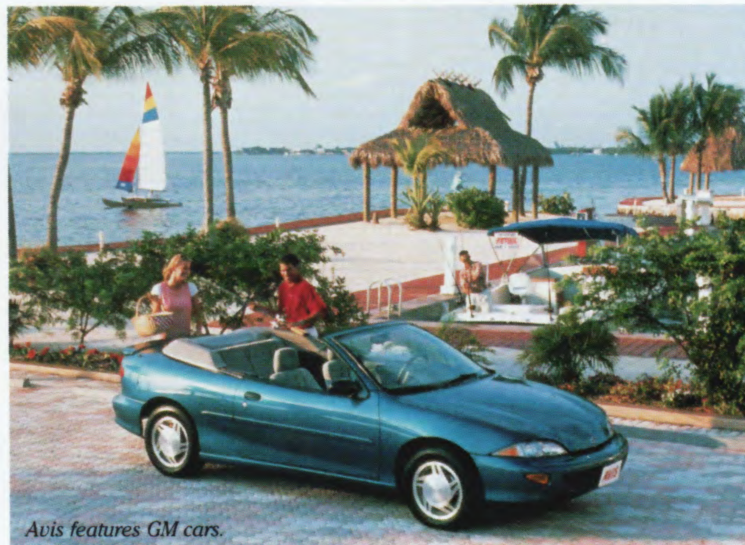
Avis features GM cars.