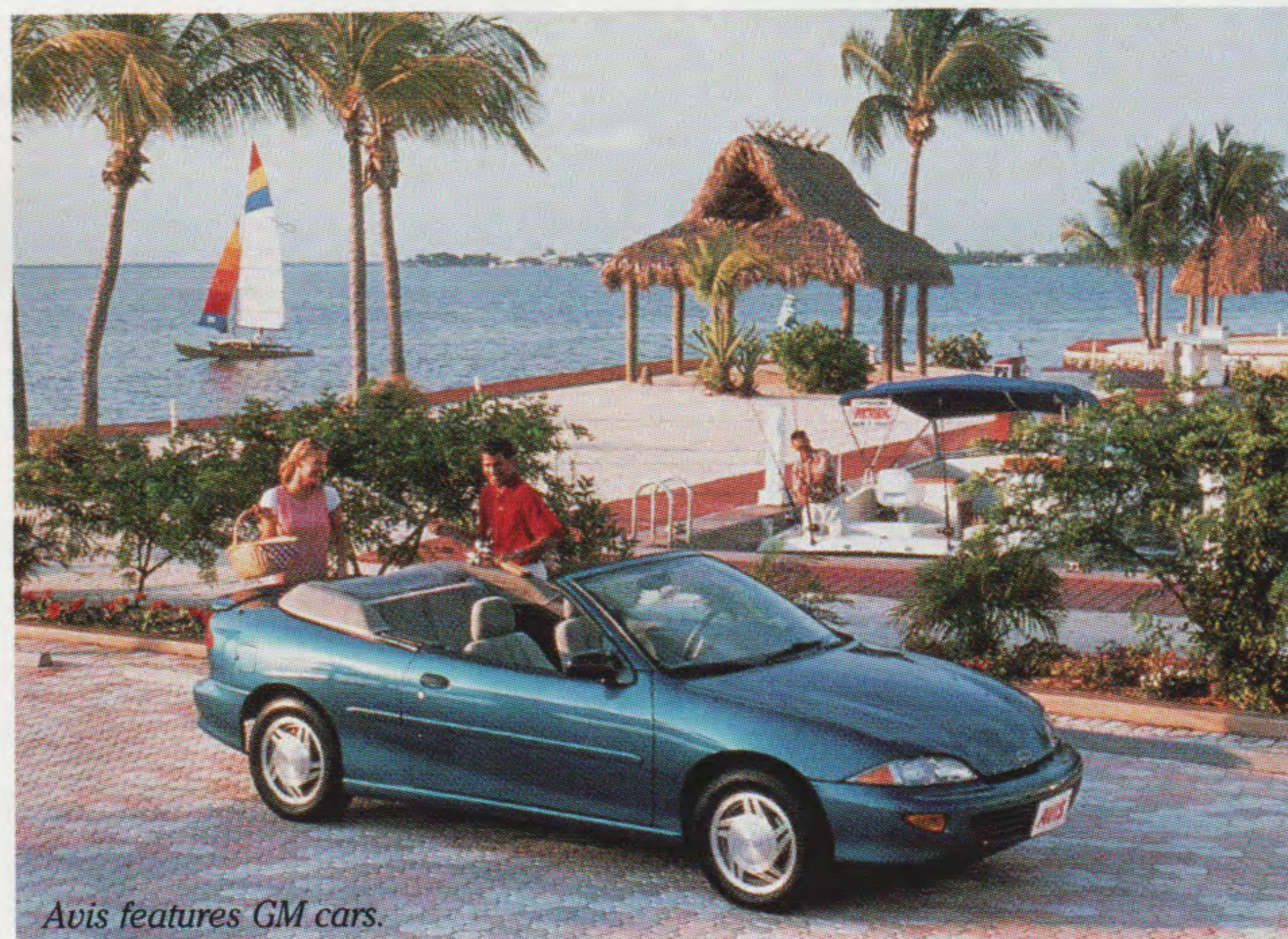
Avis features GM cars.