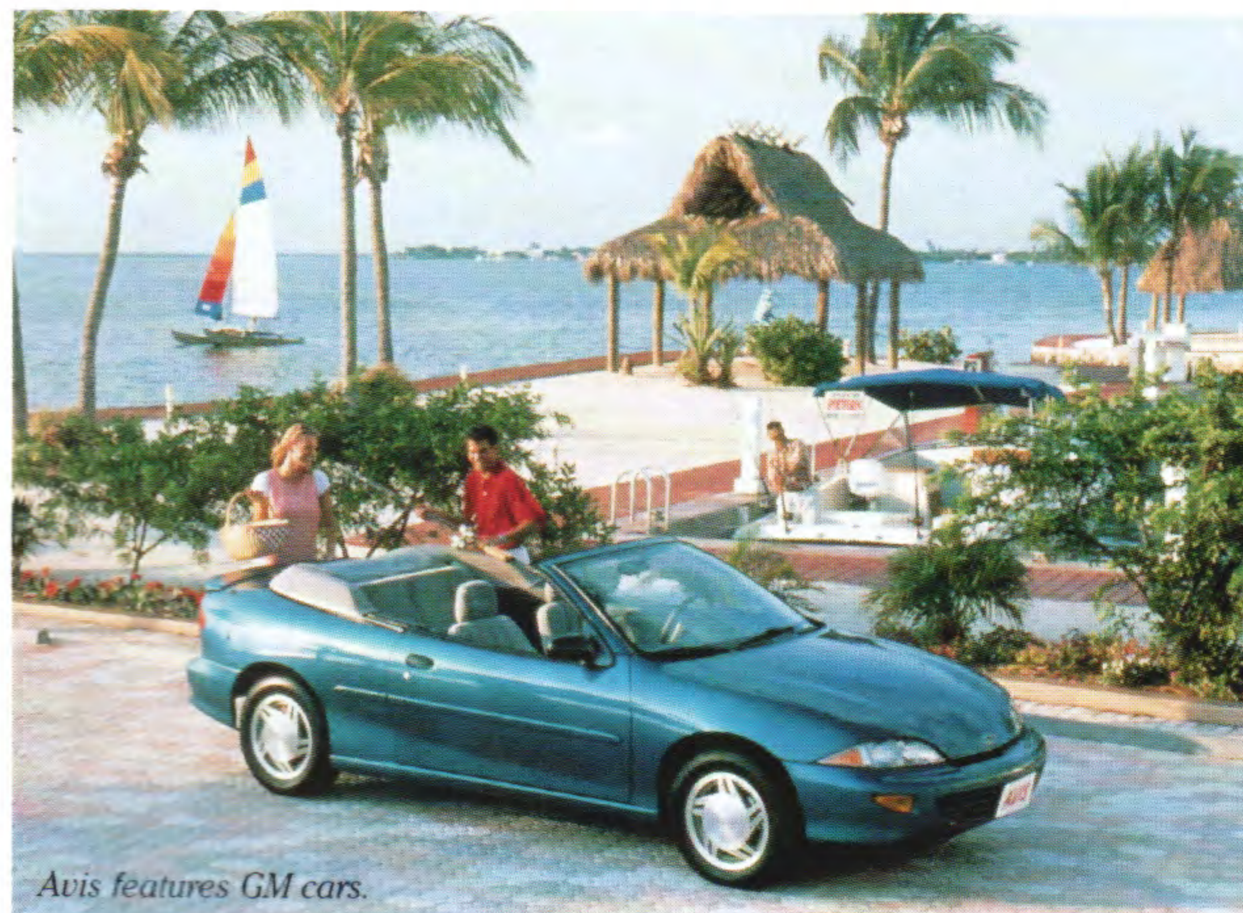
Avis features GM cars.