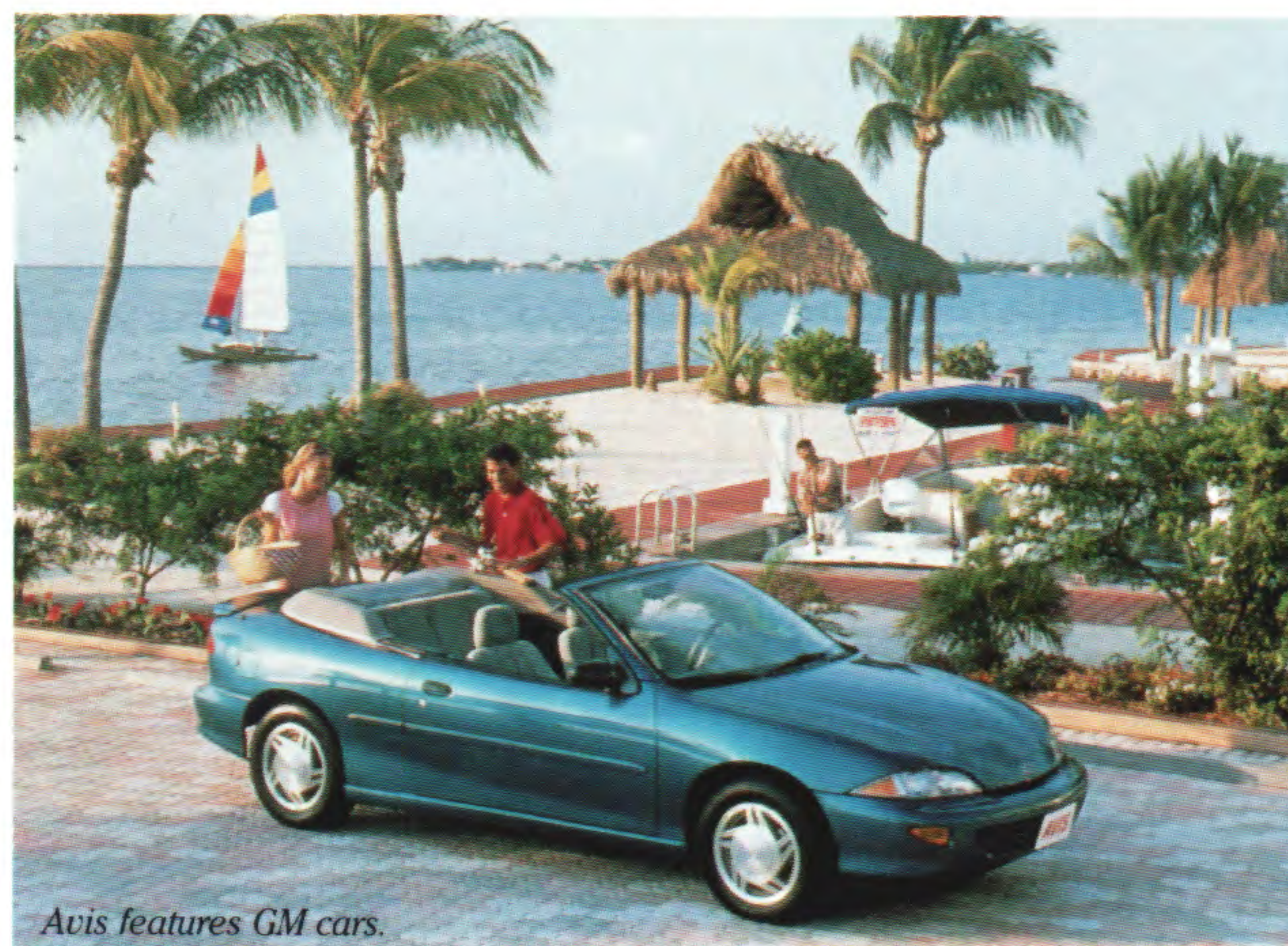
Avis features GM cars.