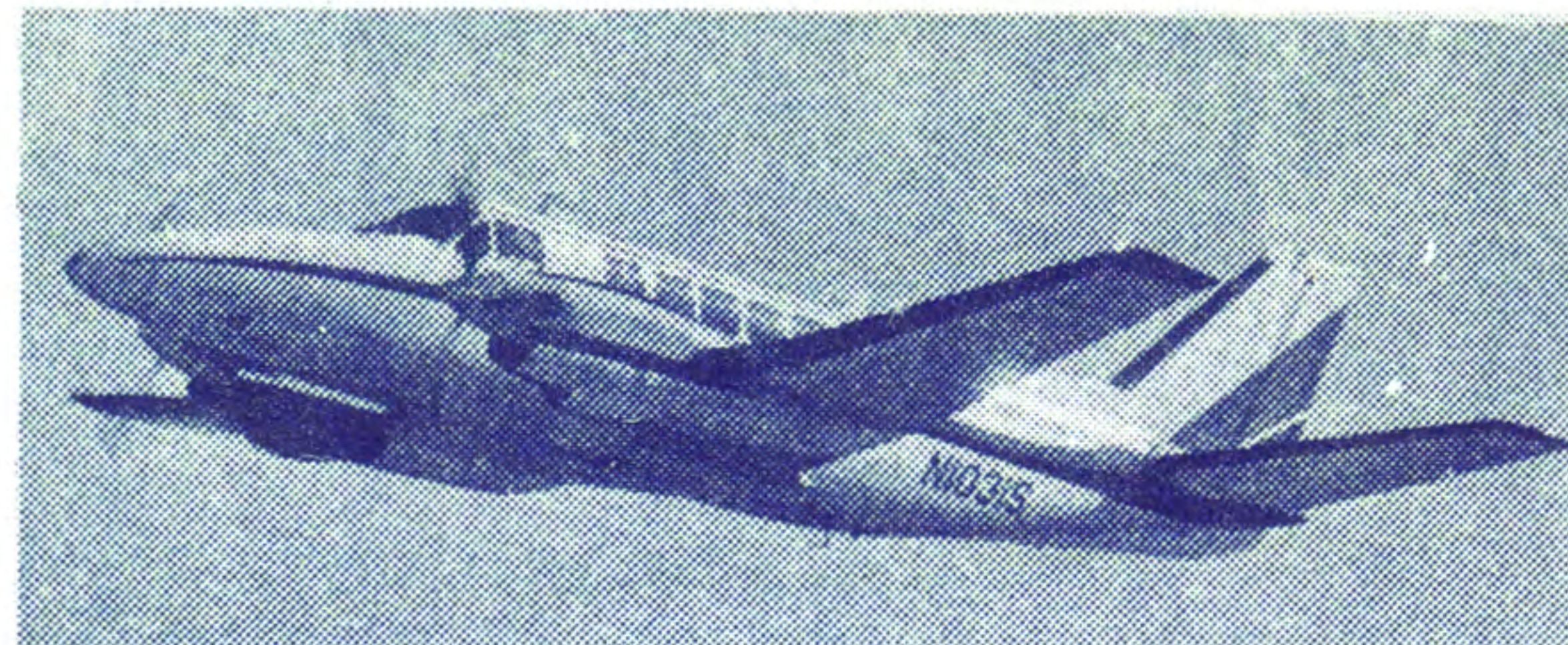
All flights are operated with Beechcraft 99 or Swearingen Metros. These twin jet-prop aircraft are all weather equipped.

AIR FREIGHT is carried on all flights. We can accommodate up to 250 lbs. per piece. Shipments can be sent prepaid or collect.