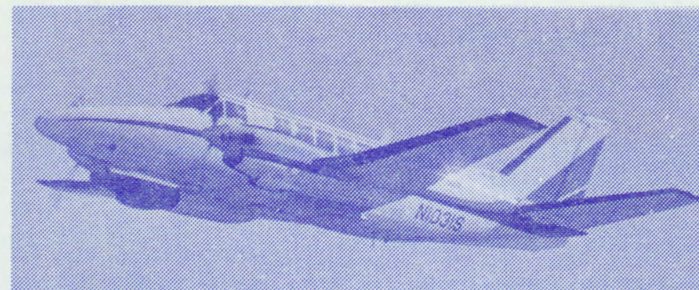
All flights are operated with Beechcraft 99 or Swearingen Metros. These twin jet-prop aircraft are all weather equipped.

FREE PARKING: Airport parking at Galesburg, Sterling/Rock Falls and Bloomington/Normal is free.