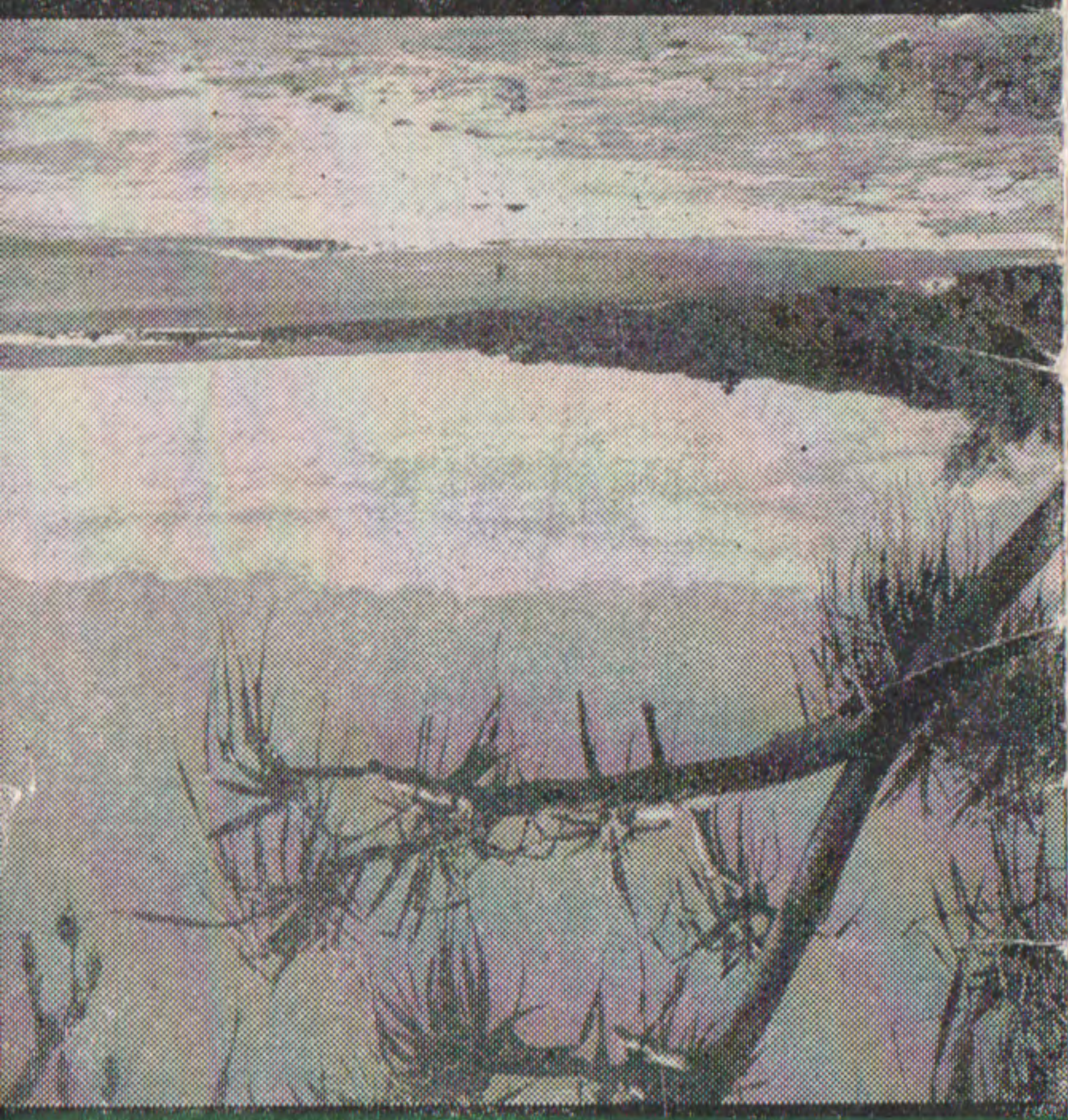
HAMOYA BEACH AT HEAVENLY HANA

HAWAIIAN AIRLINES "I'd rather fly HAWAIIAN"