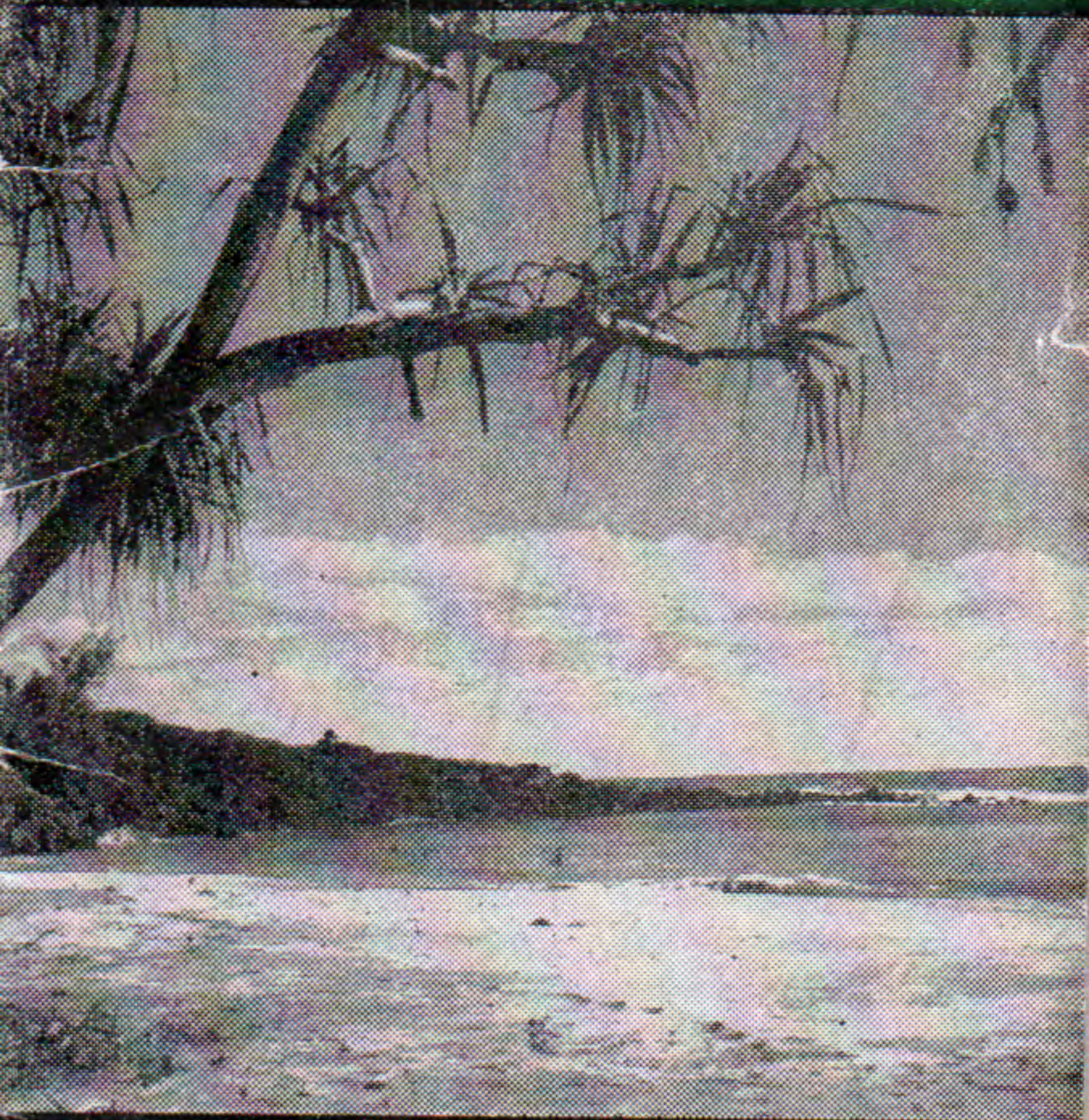
HAMO A BEACH AT HEAVENLY HANA