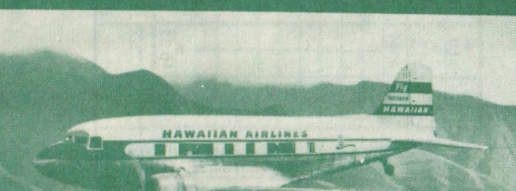
DOUGLAS VIEWMASTER with five foot wide panoramic windows