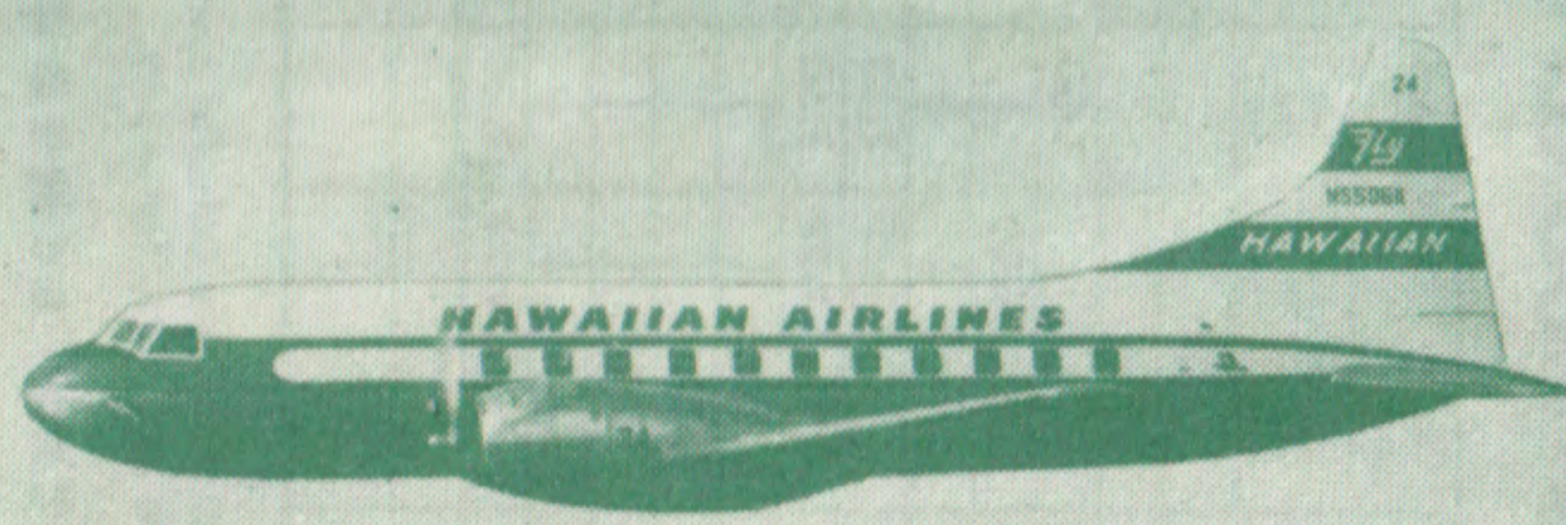
FAST PRESSURIZED CONVAIR 340