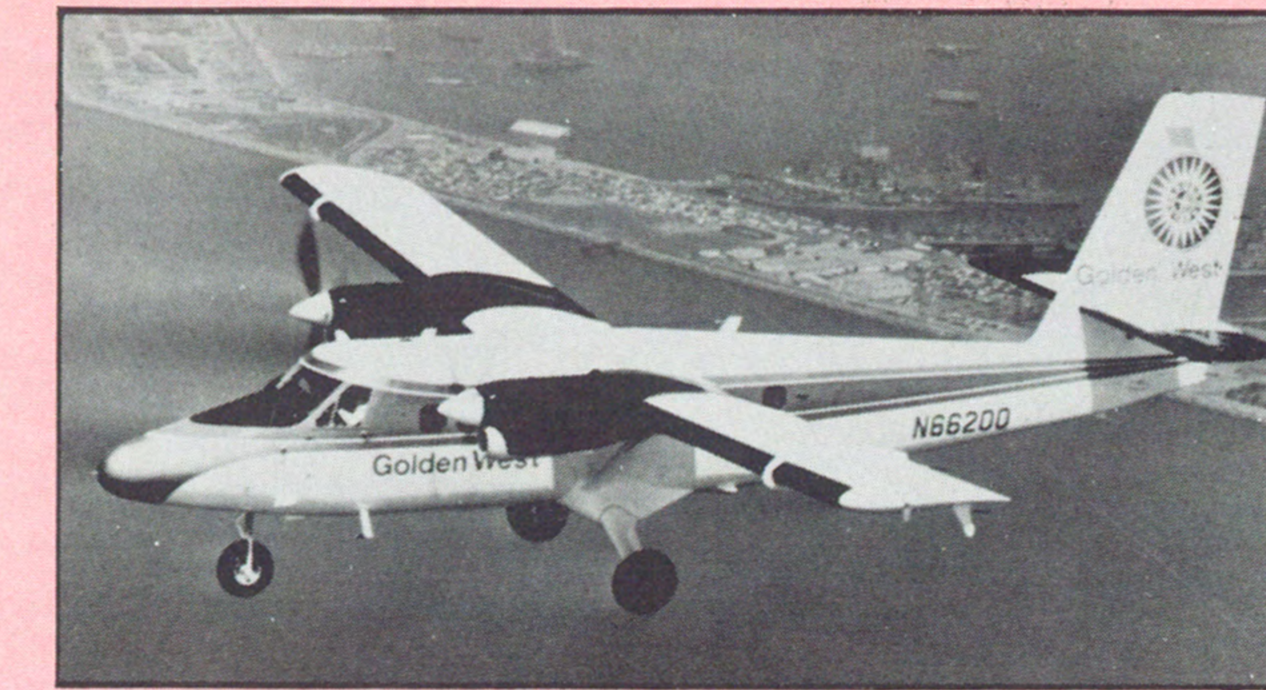
deHAVILLAND TWIN OTTER

17-passenger turbo prop-jet — Fully instrumented — Air conditioned — Spacious leg room — The most unique aircraft in the industry, featuring short field capability.