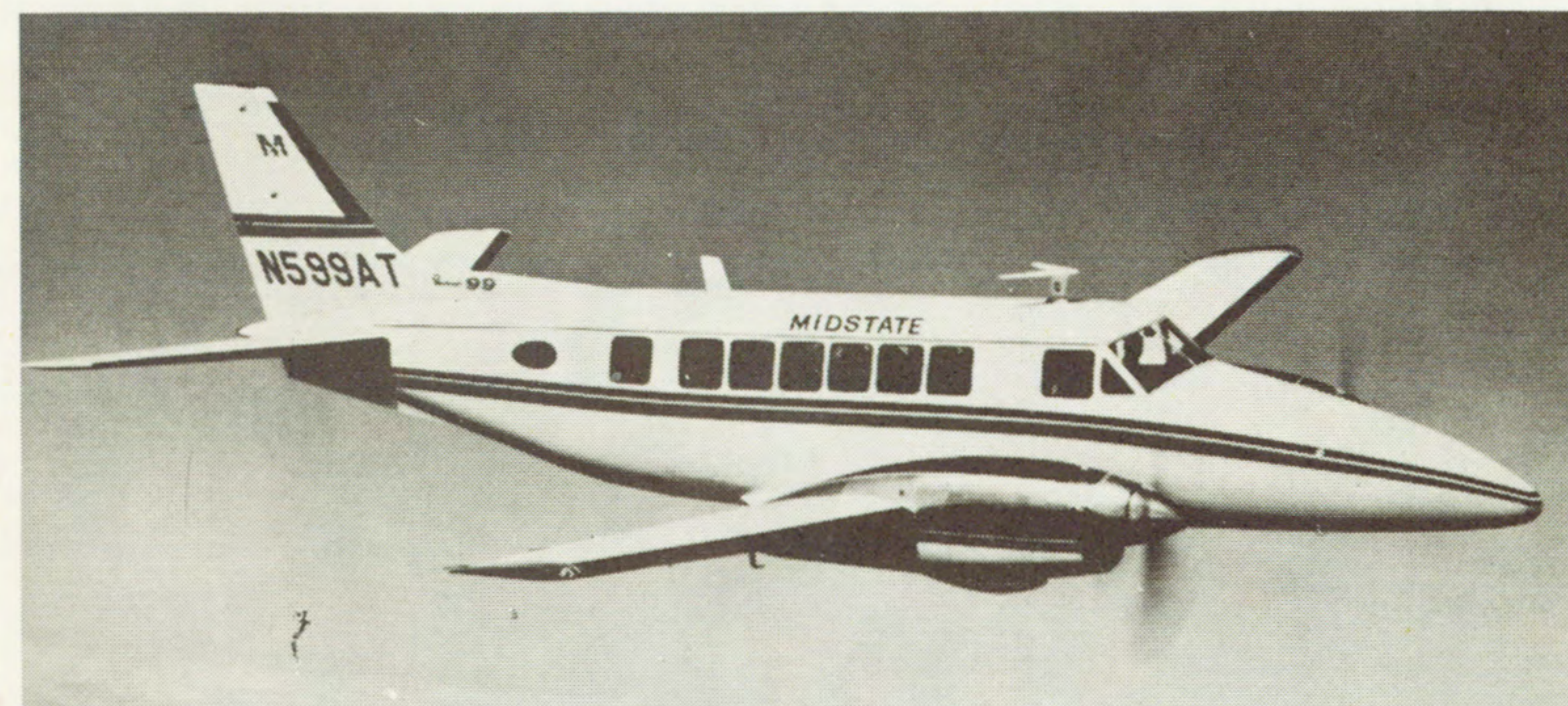
B99 Beechcraft 15-passenger twin-engine Jet prop aircraft.