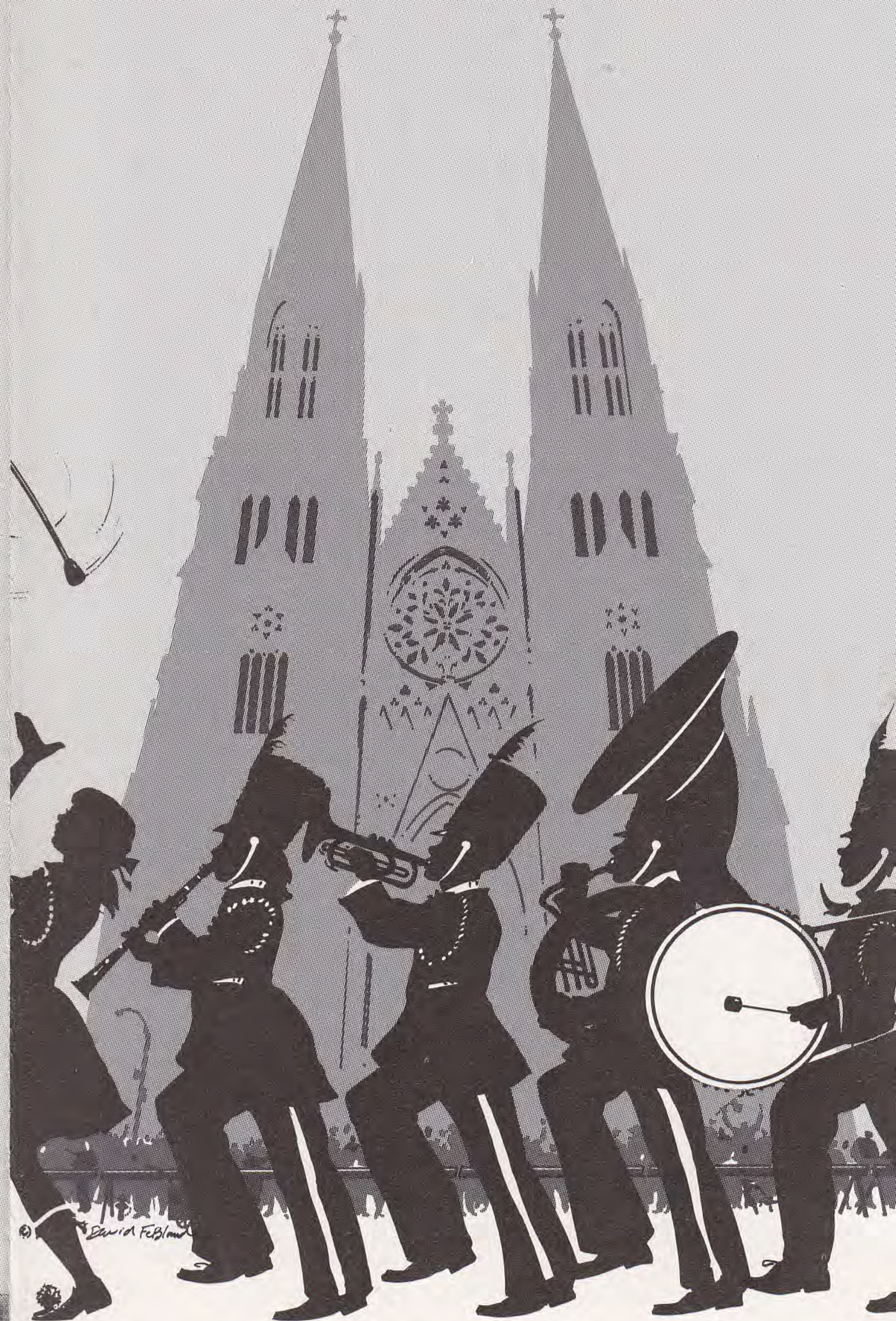
ST. PATRICK'S DAY PARADE

NEW YORK AIR THE AIRLINE THAT WORKS FOR YOUR BUSINESS.