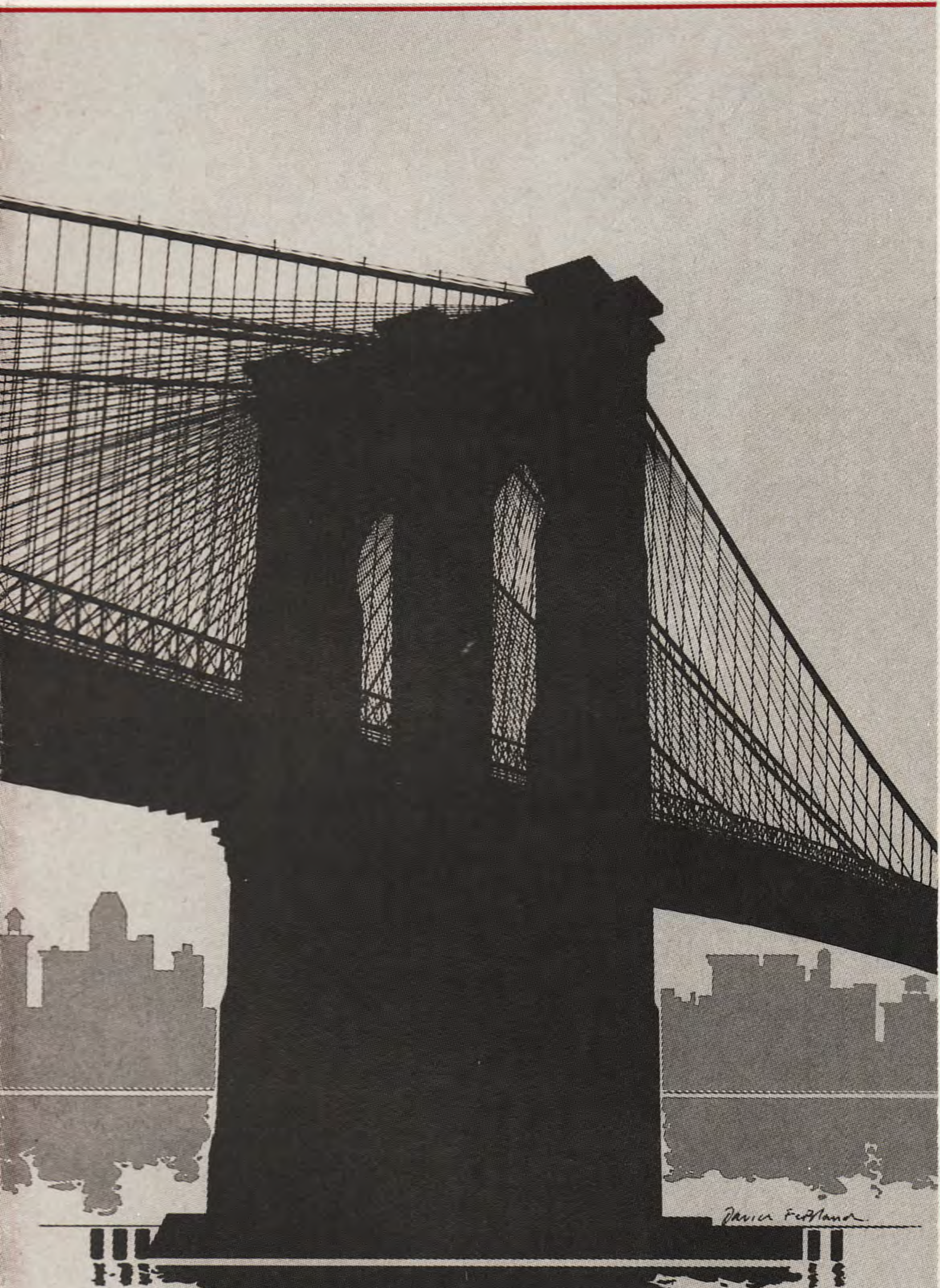
THE BROOKLYN BRIDGE