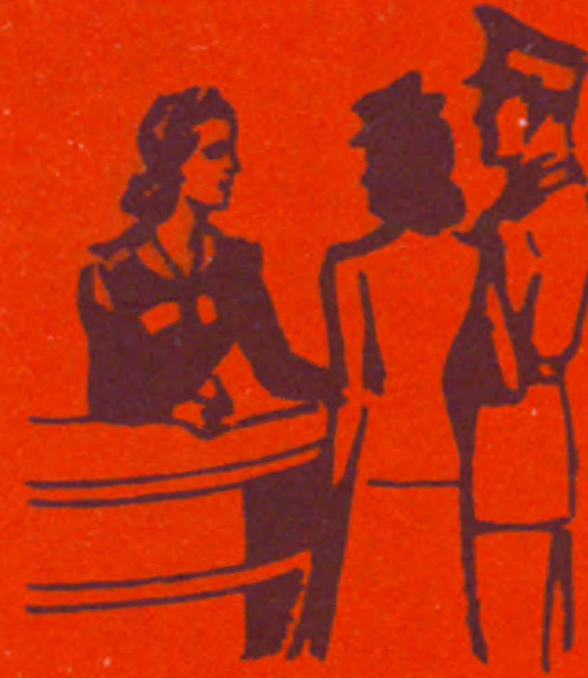
Courteous Reservation Clerks To Plan Your Entire Itinerary