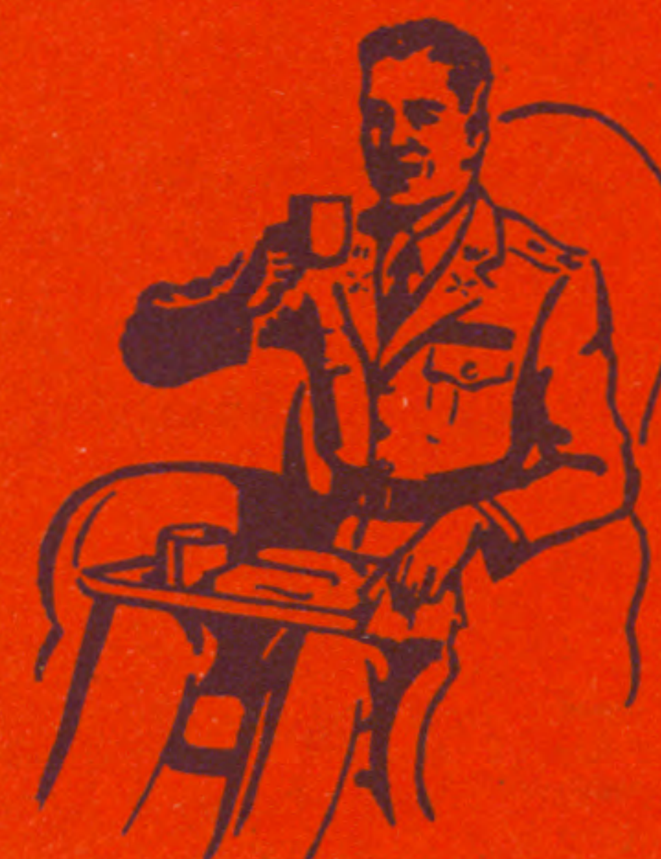
Complimentary Meals Served Aloft