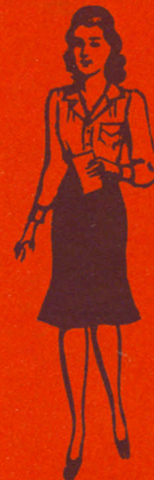
Uniformed Stewardesses To Give You Service On Every Flite