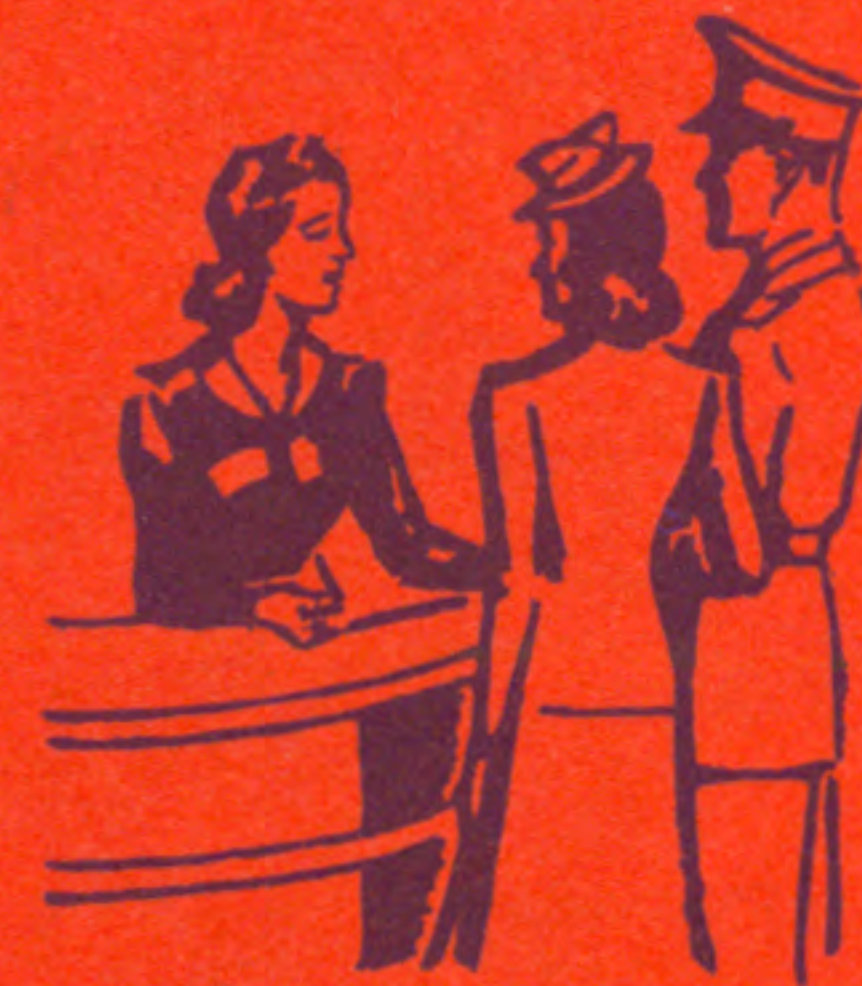
Courteous Reservation Clerks To Plan Your Entire Itinerary