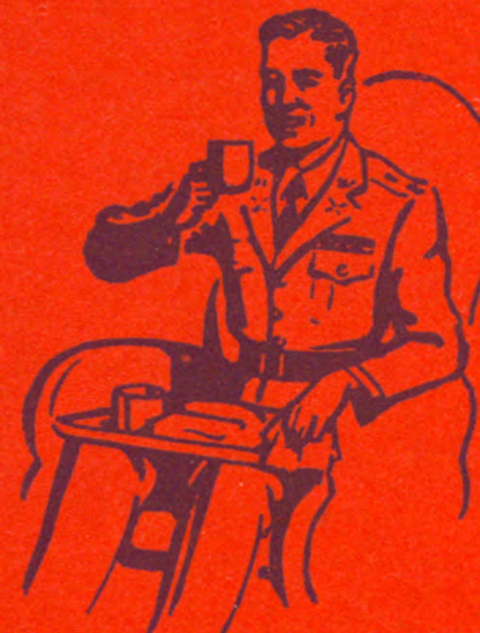
Complimentary Meals Served Aloft