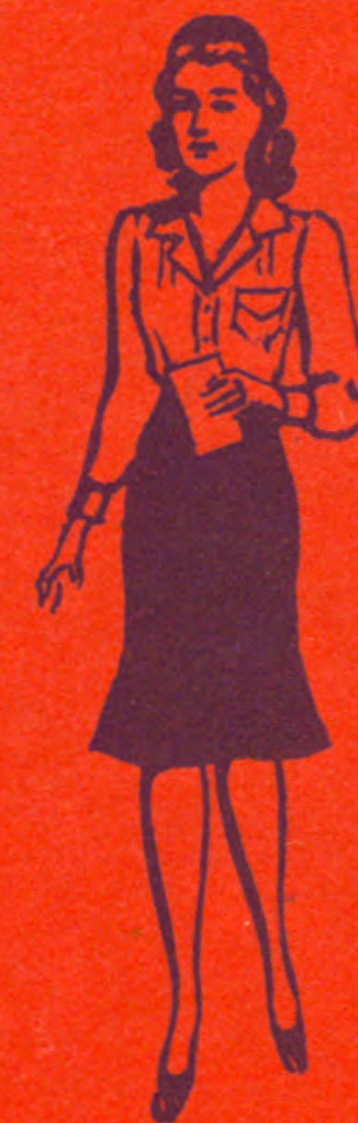
Uniformed Stewardesses To Give You Service On Every Flite