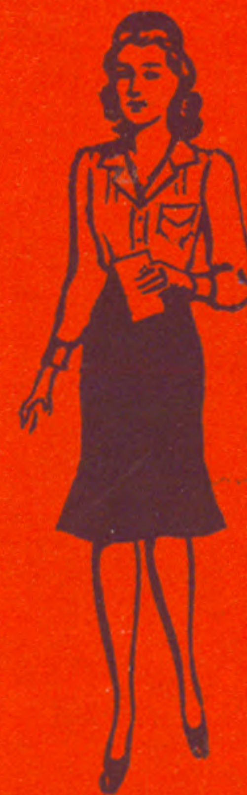
Uniformed Stewardesses To Give You Service On Every Flite