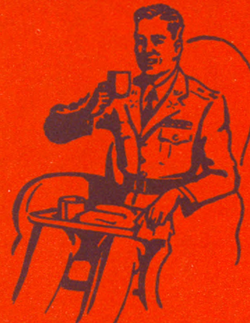
Complimentary Meals Served Aloft