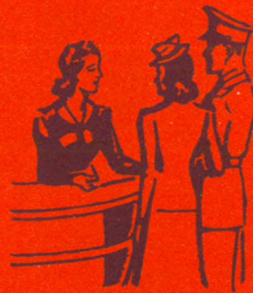
Courteous Reservation Clerks To Plan Your Entire Itinerary