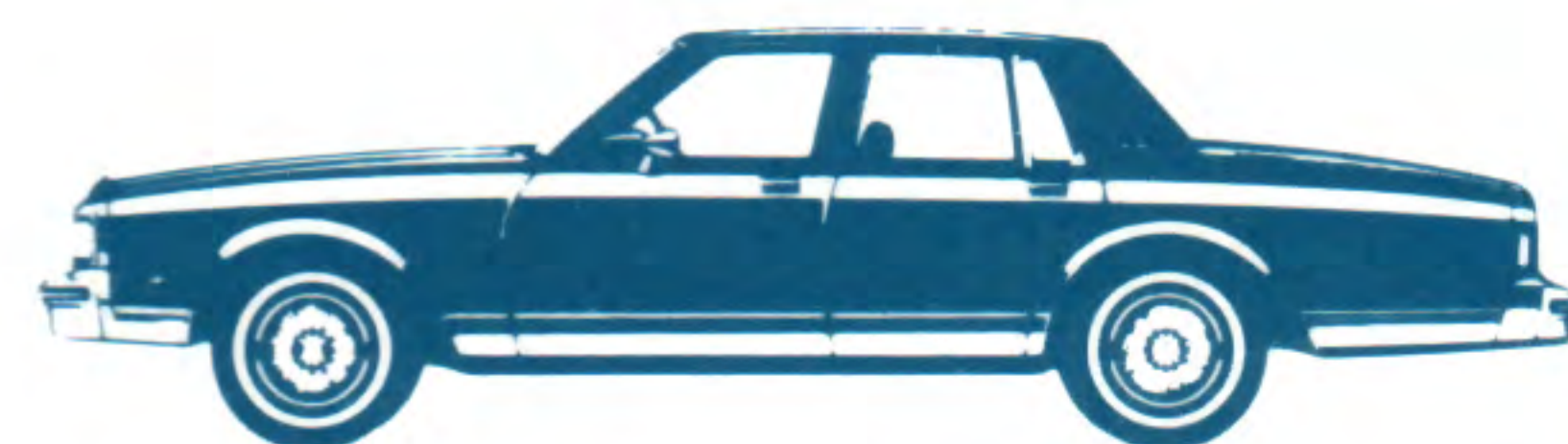
We feature GM cars like this Chevrolet Caprice Classic.