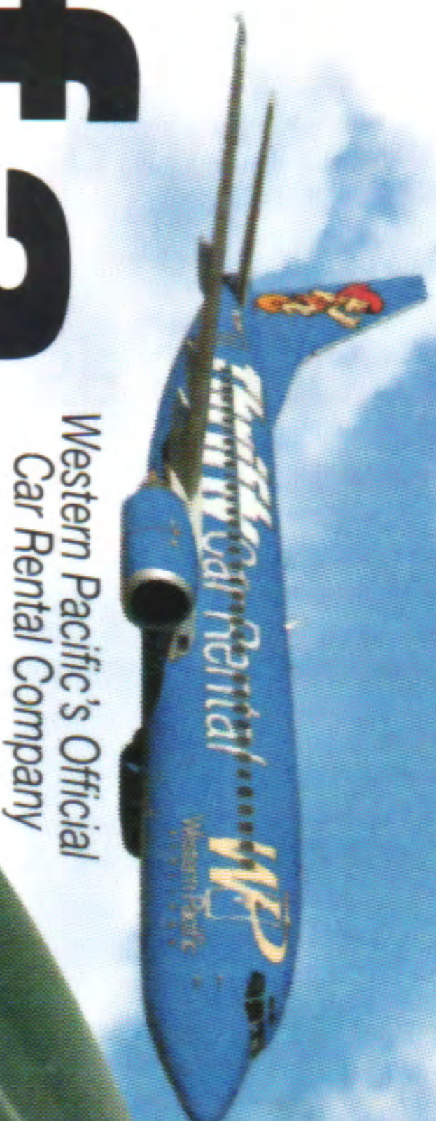
Western Pacific's Official Car Rental Company

For worldwide reservations, contact your professional travel agent or call 1-800-FOR CARS® (1-800-367-2277).