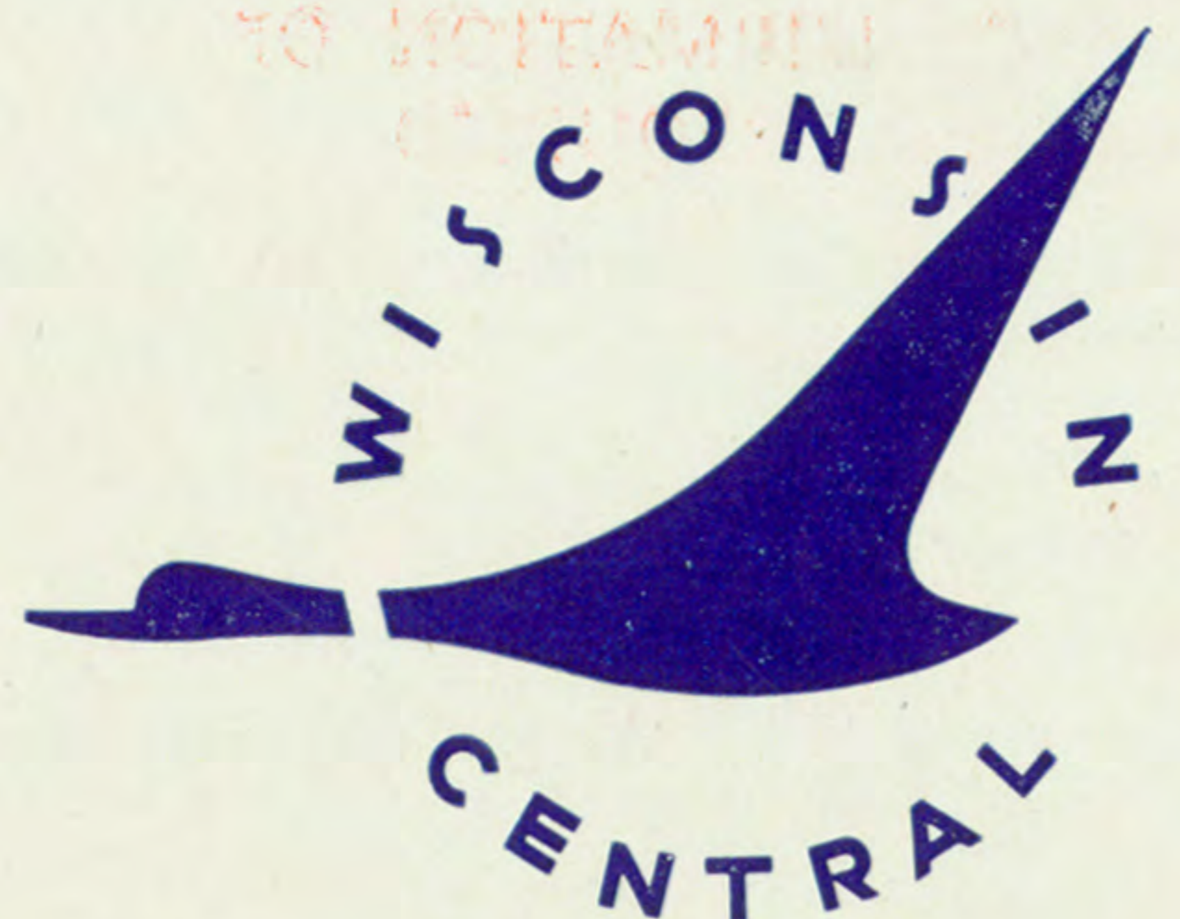
Illustrations . . . Courtesy of The Texas Company

Week-end fishing trips can be made often and with the minimum of travel time when you fly Wisconsin Central Airlines. Check the flight schedule for service to the airport nearest your favorite fishing spot or resort.